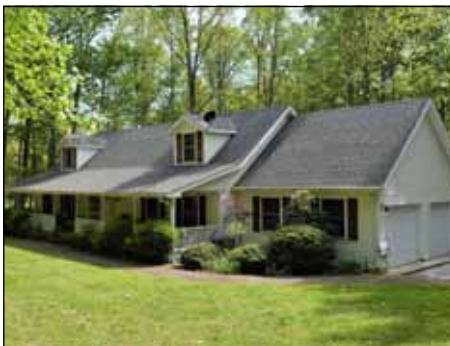
MLS 2039389 - 310 Wiggins Creek, Sewanee. $379,000