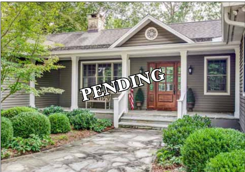
BLUFF - MLS 2010800 - 1710 Stage Coach Rd., Sewanee. 30 acres. $695,000