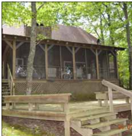
BLUFF - MLS 1964395 - 211 Rising Sun Ln., Sewanee. 5.26 acres. $295,000