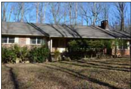
MLS 1995053 - 114 Maxon Ln., Sewanee. $399,000