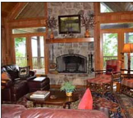
BLUFF - MLS 1945408 - 506 Ingman Cliff Rd., 3.05 acres. $688,000