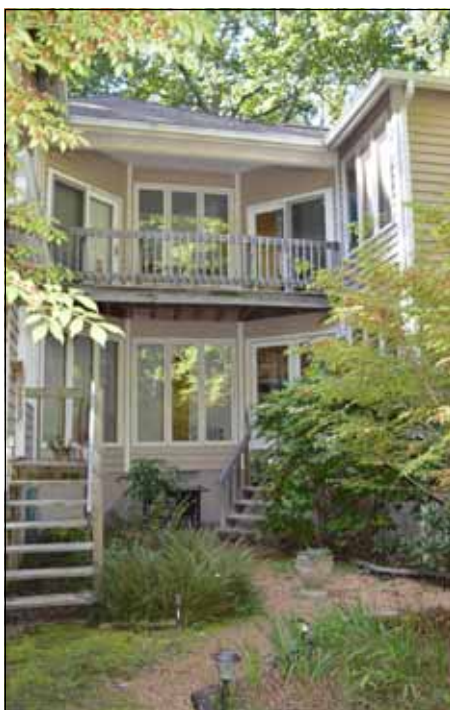
MLS 1983502 - 174 Carpenter Cir., Sewanee. $496,000