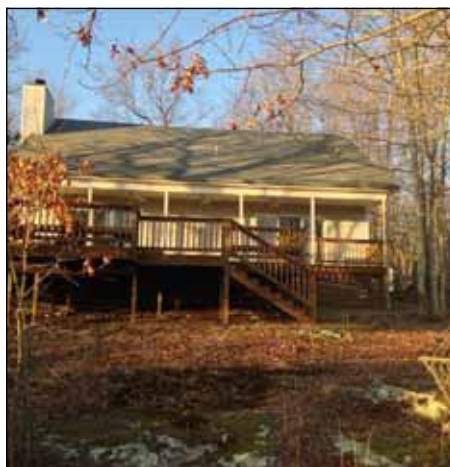
BLUFF - MLS 1994448 - 294 Jackson Point Rd., Sewanee. 20.9 acres. $299,500