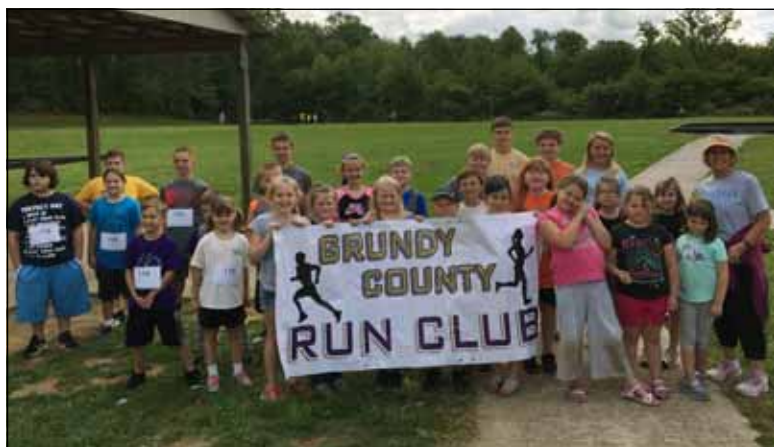
Grundy Run Club is one of the programs to be funded by a $450,000 grant awarded to the Mountain Goat Trail Alliance.