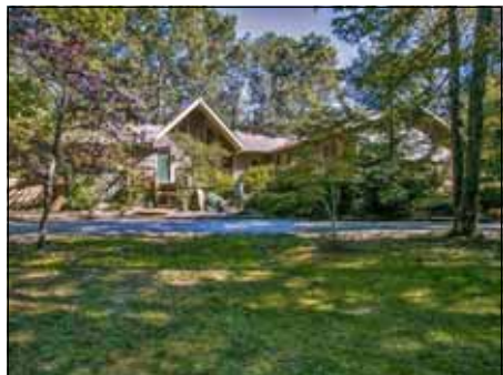
MLS 2042359 - 2120 Lakeshore, Clifftops. 5.03 acres. $439,000.