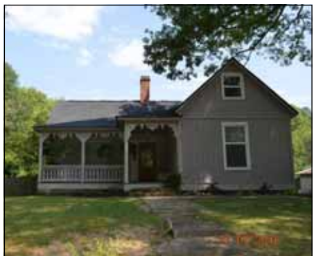
MLS 1956405 - 171 Maple St., Sewanee. $267,500