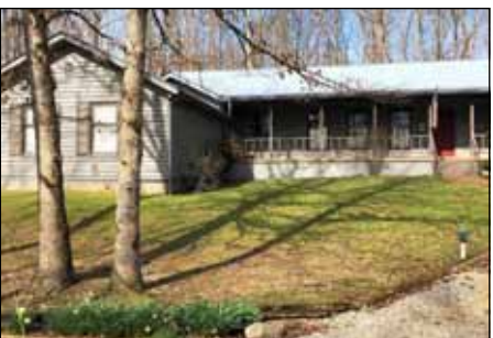
MLS 2015740 - 1205 Clifftops Ave., Monteagle. 5.39 acres. $389,000