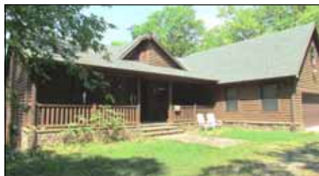
BLUFF - MLS 1974844 - 1613 Laurel Lake Dr., Monteagle. 5.3 acres. $445,000