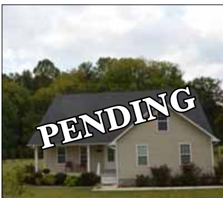
MLS 2008191 - 57 Diamond Dr., Winchester. $225,000