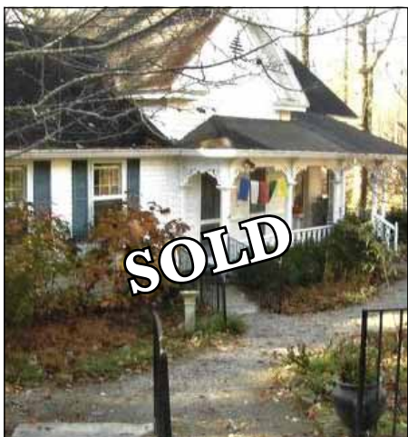
MLS 2002714 - 191 S. Carolina Ave., Sewanee. $439,000