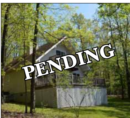
BLUFF - MLS 1930811 - 146 Jackson Point Rd., Sewanee. 13+ acres. $299,500