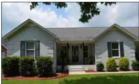
MLS 2024156 - 1573 Carter Rd., Decherd. $229,500