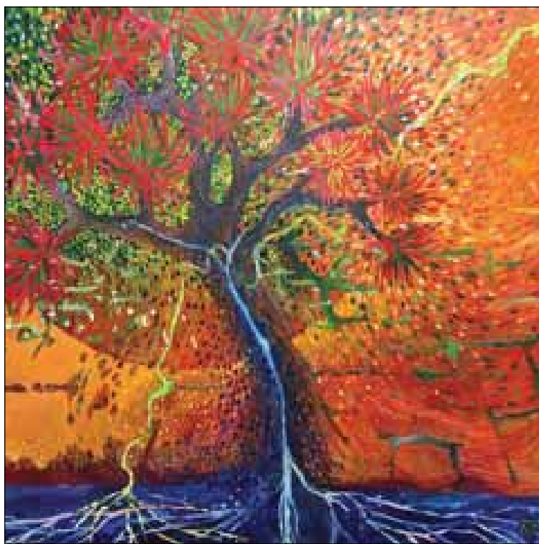
Conduit by Pippa Browne