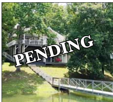
LAKEFRONT - MLS 1949994 - 681 Magnolia Dr., Winchester. $779,500