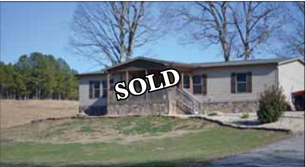
MLS 2116520 - 394 Dykes Hollow Rd. 10+/- acres. $245,000