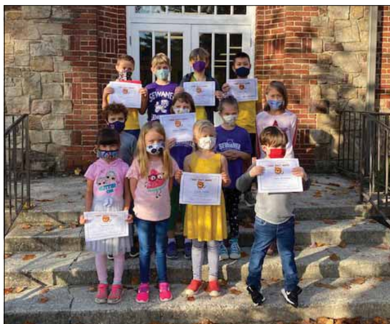
These Sewanee Elementary students received the Tiger Trait Courtesy Award for showing thoughtfulness and politeness to friends, staff, and our community.