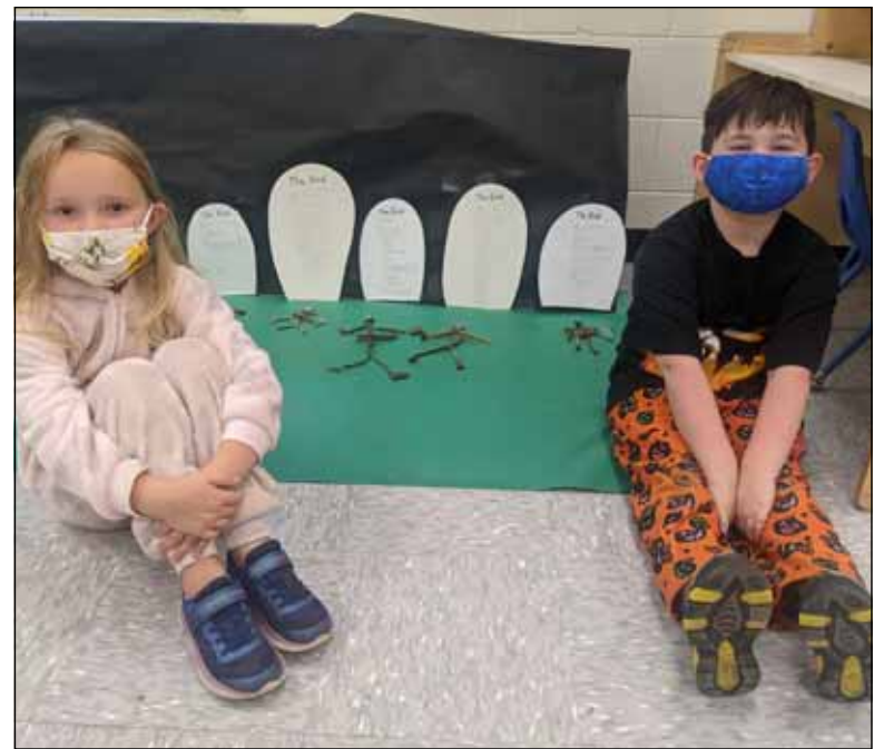
Nature skeleton graveyard.

well as a small party. Kindergarten students created a Spooky Forest Room for all to enjoy complete with a pumpkin patch, ghosts, a bat cave, and a nature skeleton graveyard. Faculty, staff, and students also wore their Halloween costumes to school and participated in an afternoon costume parade.