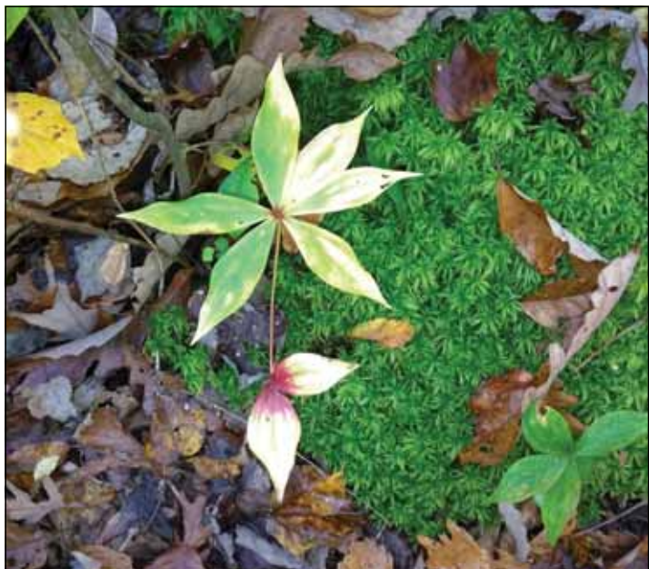
Indian Cucumber Root by Yolande Gottfried