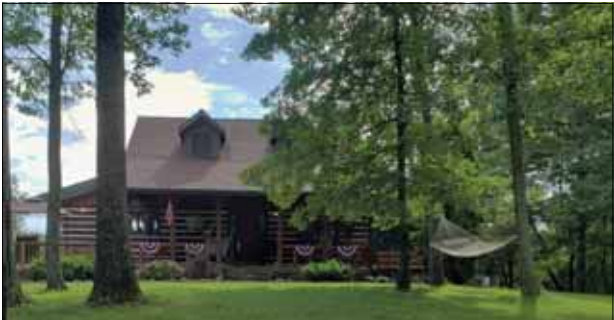
BLUFF - MLS 2169233 - 1833 Laurel Lake Dr., Monteagle. $429,000