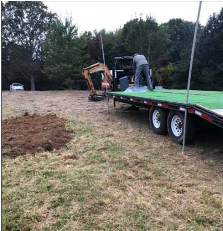
The new site of Isaiah 117 House.

For those that want to donate, visit < www.isaiah117house.com/donate > or follow the organization on Facebook at < https://www.facebook.com/Isaiah117House/ >.