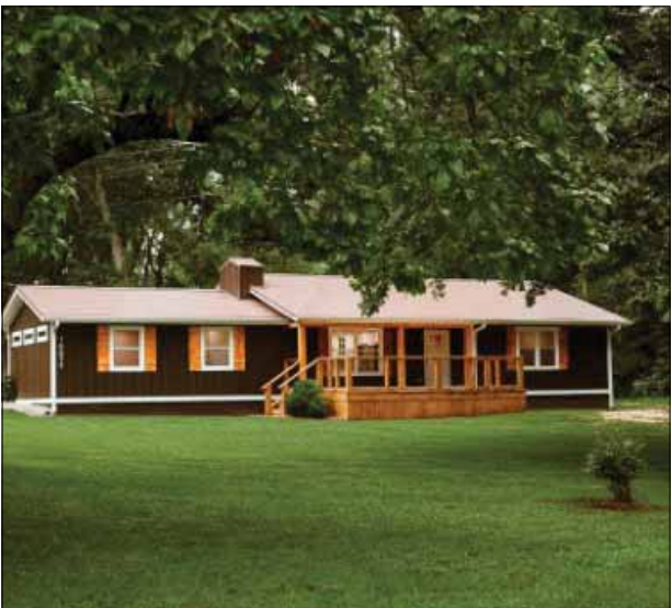
MLS 2166468 - 10879 US 41, Monteagle. $289,000