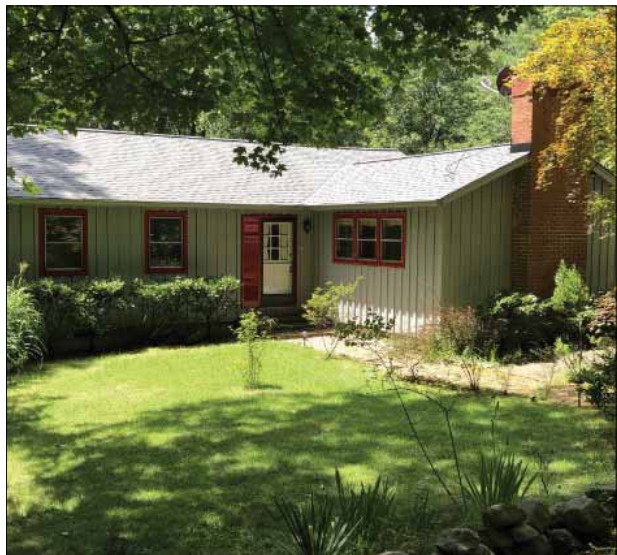
MLS 2181633 - 181 Kirby Smith Rd., Sewanee. $298,000