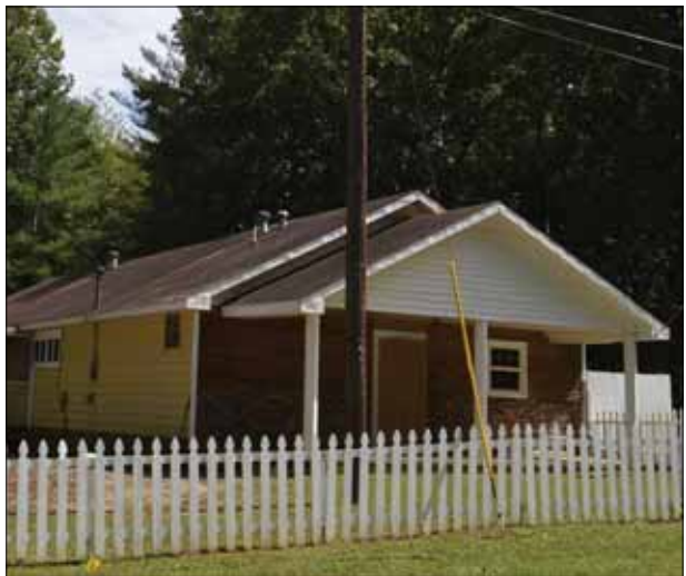
MLS 2194313 - 197 Midway Rd., Sewanee. $315,000