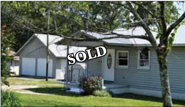
MLS 2165799 - 17 Oliver Ln., Monteagle. $149,000