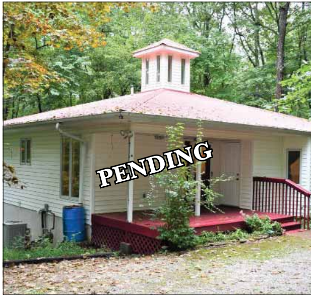
MLS 2193131 - 56 Poplar Ln., Sewanee. $368,000