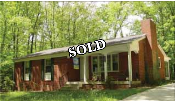
MLS 2155746 - 118 Cobbs Ln., Sewanee. $294,900