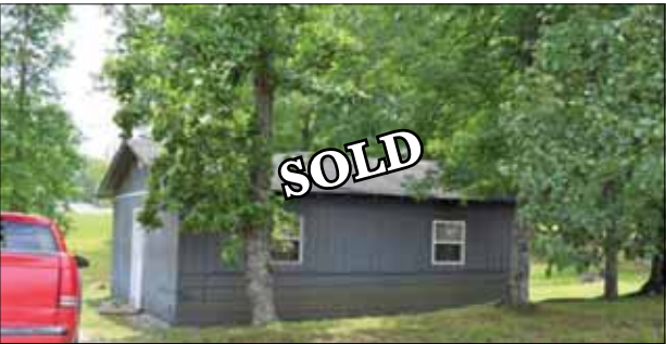
MLS 2189005 - 17 Oliver Ln. #3 & #4, Monteagle. $59,900