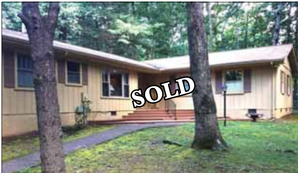
MLS 2145687 - 72 Maxon Ln., Sewanee. $479,500