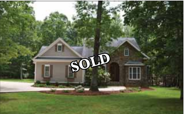
191 Girault Jones, Sewanee. $410,000