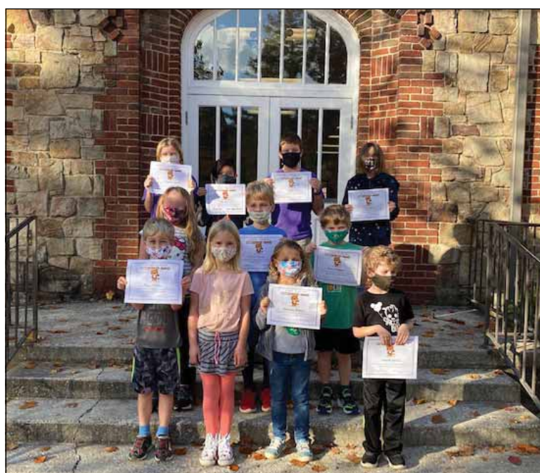
These students were presented with the Tiger Trait Citizenship Award at Sewanee Elementary. They were recognized for being respectful, following school rules, and displaying good character during the first nine weeks of school.