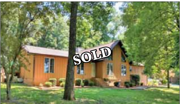
MLS 2159634 - 647 Carter Rd. $249,000