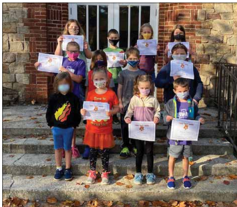
The Tiger Trait Kindness Award was given to these Sewanee Elementary students for demonstrating small acts of kindness and being friendly and considerate toward others.