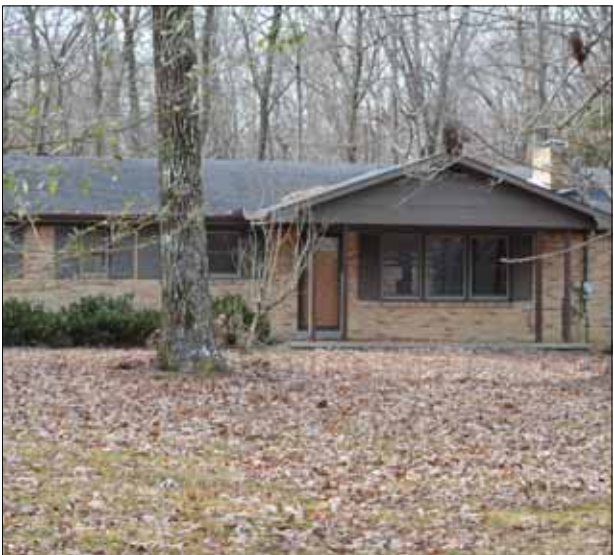
MLS 2112396 - 1020 Sherwood Rd., Sewanee. $189,000