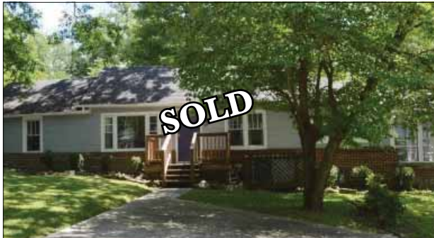
MLS 2171490 - 125 Palmetto Ave., Sewanee. $175,000