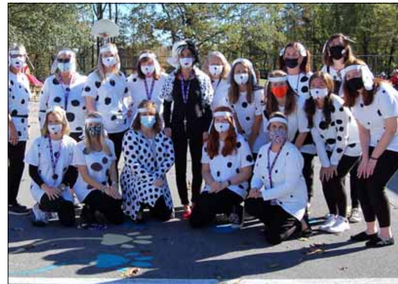
SES faculty and staff ready for Halloween.