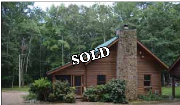
MLS 2173080 - 1045 Winterberry Dr., Monteagle. $365,000