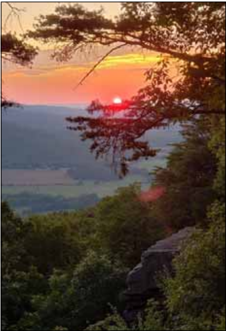
CABIN WITH BLUFF VIEW - MLS 2053333 - 160 Vanderbilt Ln., Sewanee. $394,000