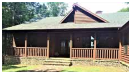
BLUFF - MLS 1974844 - 1613 Laurel Lake Dr., Monteagle. 5.3 acres. $445,000