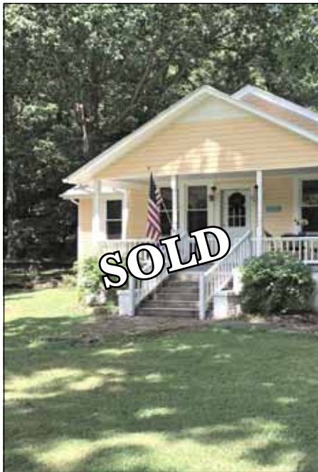
MLS 2060991 - 240 Maple St., Sewanee. $225,000