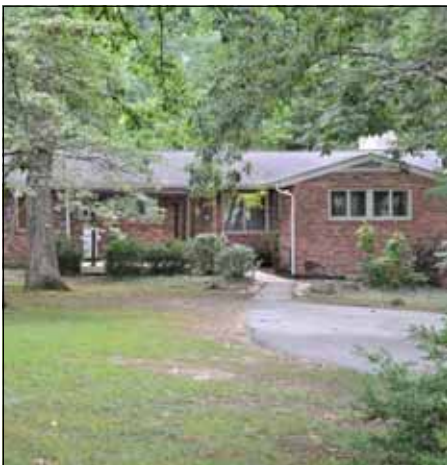
MLS 2070485 - 283 Green's View Rd., Sewanee. $389,000