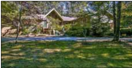
MLS 2042359 - 2120 Lakeshore, Clifftops. 5.03 acres. $439,000.