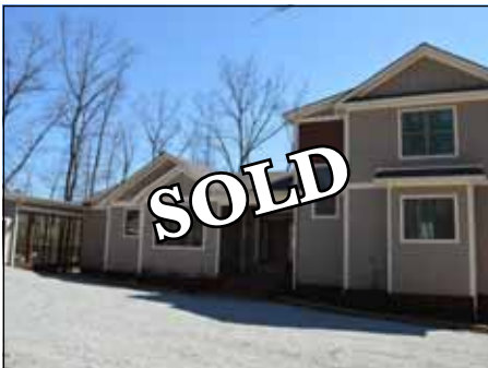
LAKEFRONT - MLS 2023698 - 1175 Cooley's Rift Blvd., Monteagle. $549,000