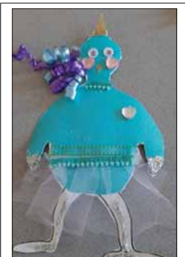
I am a unicorn.

Topping, trimming, bluff/lot clearing, stump grinding and more! *Bucket truck or climbing* Free wood chips with job Will beat any quoted price! Satisfaction guaranteed!! —Fully licensed and insured— kingstreeservice.com Call (931) 598-9004—Isaac King