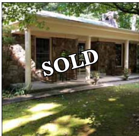
MLS 2059512 - 148 Proctors Hall Rd., Sewanee. $348,000