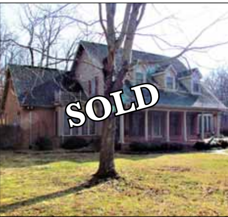
MLS 2016115 - 52 Sherwood Trail, Sewanee. 2.46 acres. $339,500