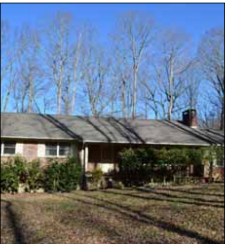
MLS 1995053 - 114 Maxon Ln., Sewanee. $399,000