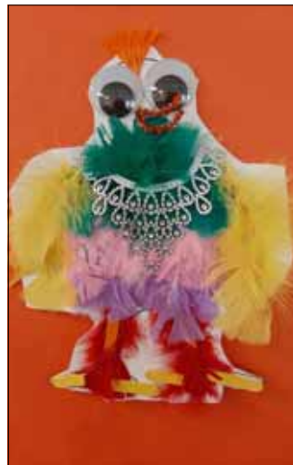
I am an owl.

Turkeys are "hiding" throughout this issue of the Messenger and may try to sneak in the next issue. See them all in color at <www.sewaneemessenger.com> or <sewaneemessenger.smugmug.com>.