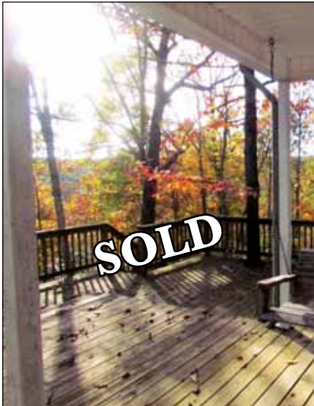
BLUFF - MLS 2065242 - 294 Jackson Point Rd., Sewanee. 20.9 acres. $299,000