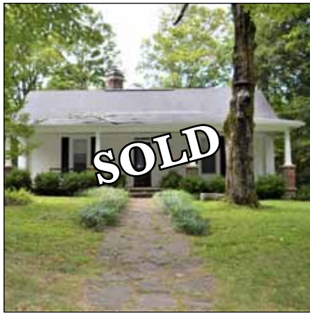
MLS 2070547 - 328 Bob Stewman Rd., Sewanee. $299,000