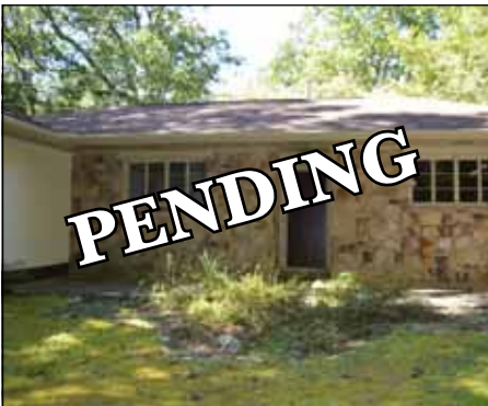
MLS 2078548 - 246 Curlicue Rd., Sewanee. $374,000