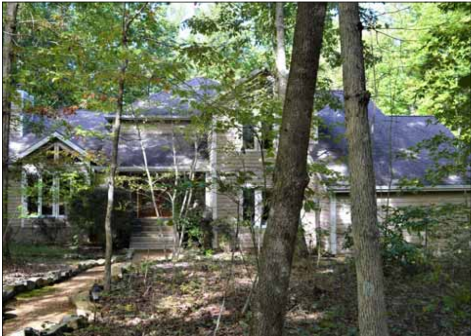
MLS 1983502 - 174 Carpenter Cir., Sewanee. $460,000