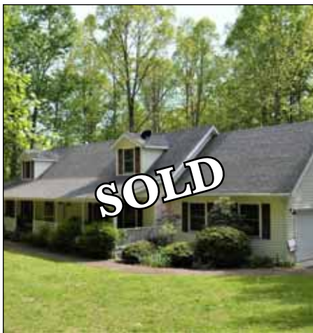
MLS 2052244 - 310 Wiggins Creek, Sewanee. $359,000