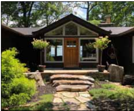
BLUFF - MLS 2063145 - 185 Turning Point Ln., Sewanee. 12+acres. $698,000