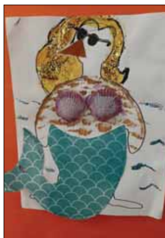
I am a mermaid.

Proceeds from sales are used to provide area high school graduates scholarships to pursue medical careers, and for continuing education for the staff at STRHSW Sewanee Physical Therapy department. The Shop is normally open Tuesdays, Thursdays and Saturdays, 9:30 a.m.—1 p.m. For more information call (931) 598-0136 during hours of operation.