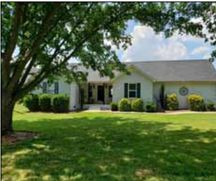
MLS 2024156 - 1573 Carter Rd., Decherd. $225,500