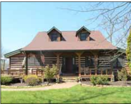
BLUFF - MLS 1923054 - 1833 Laurel Lake Dr., Monteagle. $429,000