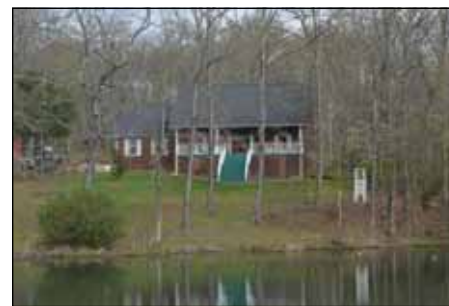
MLS 1924650 - 890 Boswell Ct., Monteagle. 3+ acres. $319,000