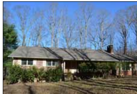
MLS 1995053 - 114 Maxon Ln., Sewanee. $449,900