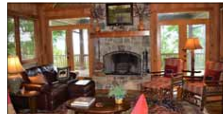
BLUFF - MLS 1945408 - 506 Ingman Cliff Rd., 3.05 acres. $688,000