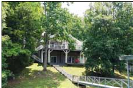
LAKEFRONT - MLS 1949994 - 681 Magnolia Dr., Winchester. $779,500