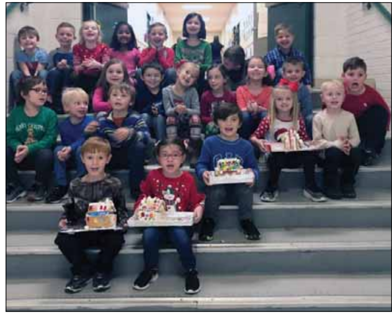
The Monteagle Elementary School kindergarten class enjoyed an afternoon of decorating gingerbread houses with their family.