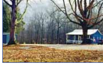
414 TATE RD. Charming new country home on 2.44 beautiful acres w/detached garage. Priced to sell. $175,000