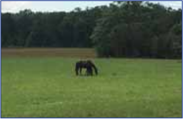
20+ PICTURESQUE ACRES. Near Savage Gulf, open pasture, barn and pond. Simply stunning!