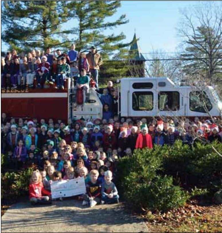
In our continuing efforts to teach our students to be kind, contributing members of our community, Sewanee Elementary recently conducted our annual Tiger Paws for Pennies campaign to raise money for Operation Noel. This year our giving totaled $1,175.14. Thank you to all our students and families who brought in their spare change.

All material in the Sewanee Mountain Messenger and on its websites are copyrighted and may not be published or redistributed without written permission.