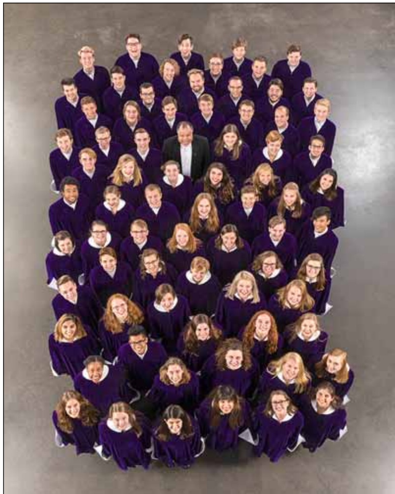
The St. Olaf Choir.