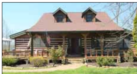
BLUFF - MLS 1923054 - 1833 Laurel Lake Dr., Monteagle. $439,000