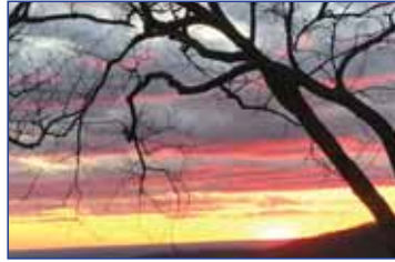
101 CARRUTHERS RD. Extraordinary sunset view on the Domain. 2820 sq. ft. w/unfinished basement. Two fireplaces and views from every room.