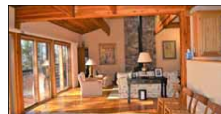
BLUFF - MLS 1906326 - 208 Vanderbilt Ln., Sewanee. $849,000