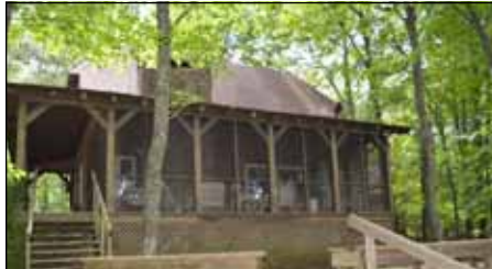
BLUFF - MLS 1964395 - 211 Rising Sun Lane, Sewanee. 5.26 acres. $295,000