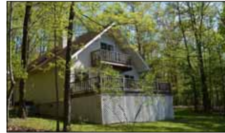
BLUFF - MLS 1930811 - 146 Jackson Point Rd., Sewanee. 13+ acres. $299,500