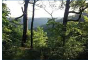
SUNSET BLUFF VIEW. 15 acres, private and close to town, priced at $125,000