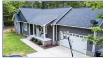
219 LIGHTNING BUG LANE. Fantastic new construction. 3 BR, 2 BA. Minutes from campus, beautiful wooded lot. $219,000