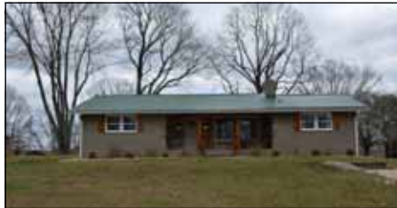
MLS 1994452 - 24 Overton Ave., Monteagle. $219,000