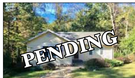
MLS 1982786 - 212 Tennessee Ave., Sewanee. $315,000