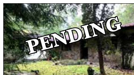
MLS 1986674 - 246 Curlicue Rd., Sewanee. $348,000