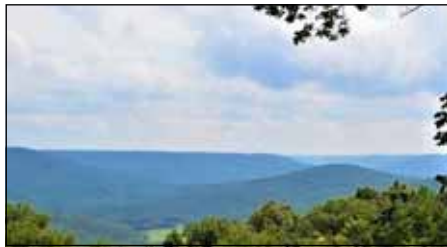
BLUFF - MLS 1878711 - 226 Rattlesnake Springs Ln., Sewanee. $749,000