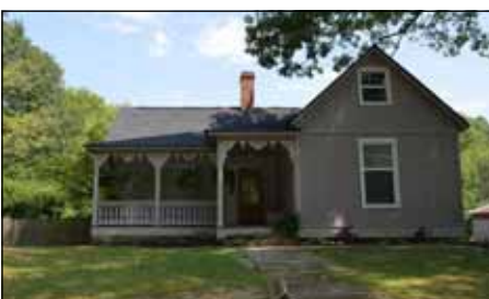
MLS 1956405 - 171 Maple St., Sewanee. $274,500