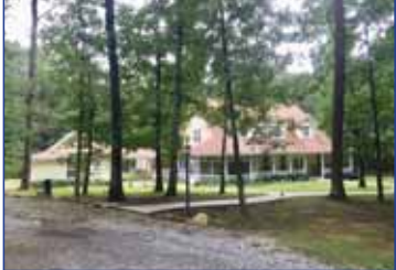
807 TIMBERWOOD TRACE. Stunning custom home, gated community, gourmet kit, 5 BR 3 BA, 5.54 ac. Loaded with extras. $445,000