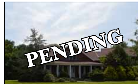
MLS 1975100 - 677 Breakfield Rd., Sewanee. $479,000