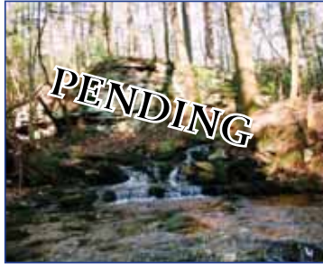
30.50 ACRES Bluff views, waterfall, creek, rocky face, giant hemlocks. 30.50 acres $200,000

Lynn Stubblefield (423) 838-8201 Susan Holmes C'76 (423) 280-1480 Freddy Saussy, C'99 (931) 636-9582