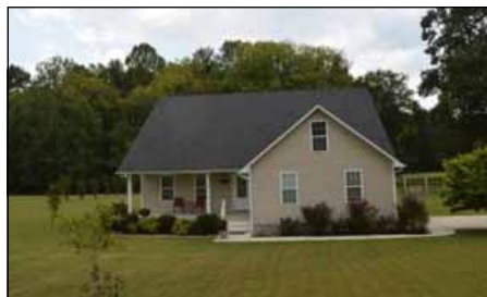
MLS 1975436 - 57 Diamond Dr., Winchester. $235,000