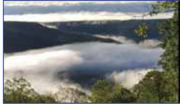
SHERWOOD RD. Stunning sunrise view over Lost Cove. 3.3 miles from Univ. Ave 1,000+ feet of view 17.70 ac. $330,000