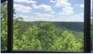
1728 RIDGE CLIFF DR. Custom log home with a wonderful view. Great rm, large screened in porches. Priced to sell. $219,500