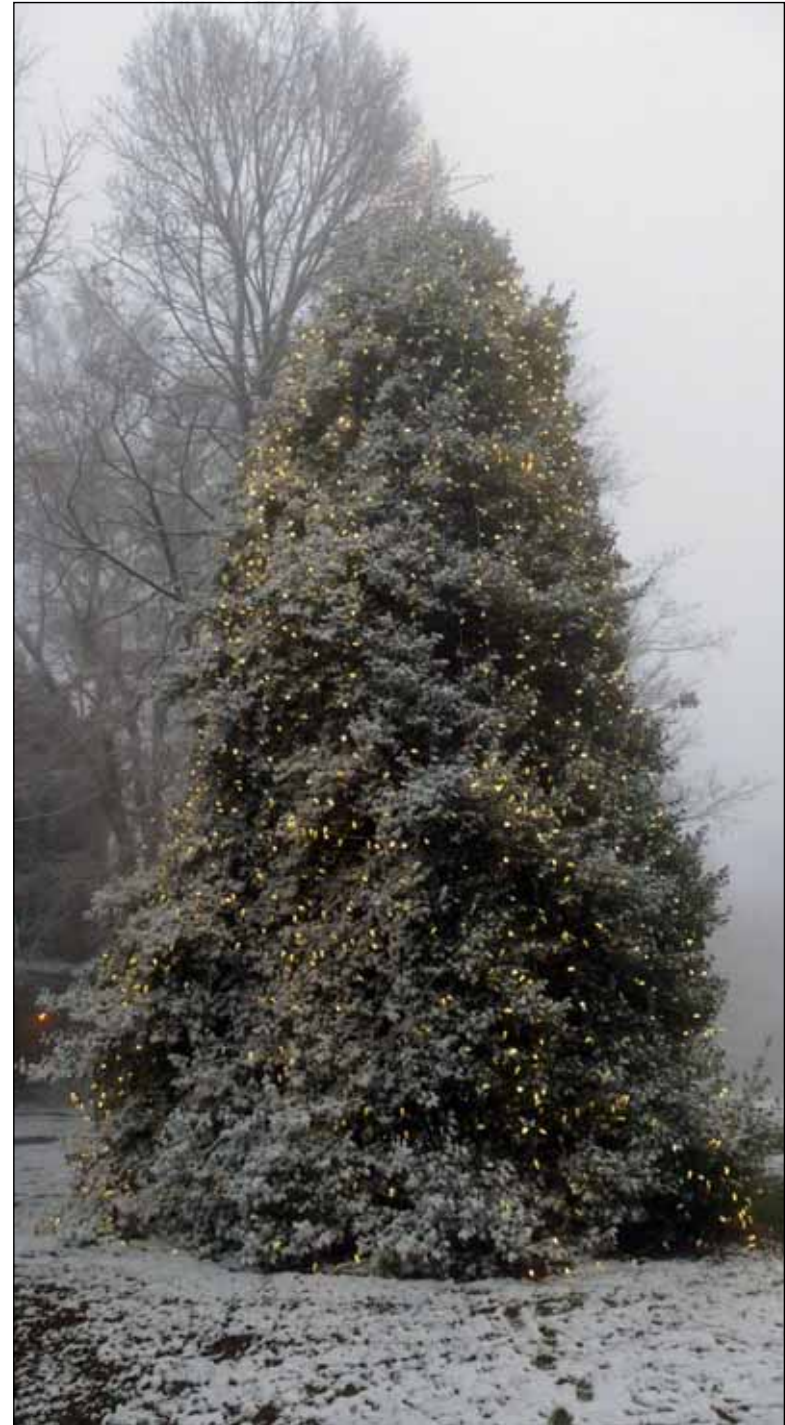
First snow in December.