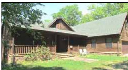
BLUFF - MLS 1974844 - 1613 Laurel Lake Dr., Monteagle. 5.3 acres. $445,000