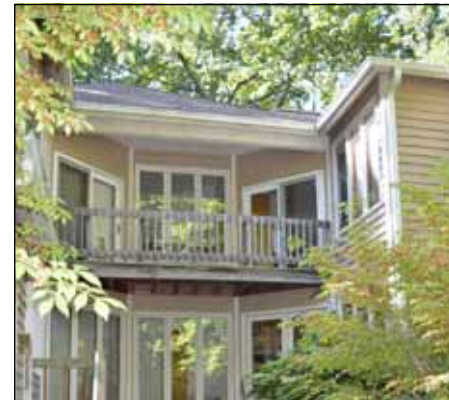
MLS 1983502 - 174 Carpenter Cir., Sewanee. $525,000