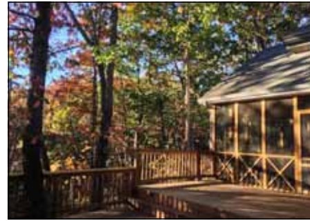
BLUFF - MLS 1994448 - 294 Jackson Point Rd., Sewanee. 20.9 acres. $299,500