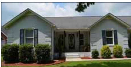
MLS 1952909 - 1573 Carter Rd., Decherd. $229,500