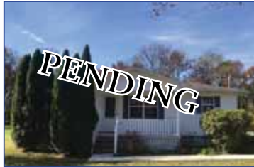
MLS#1992853. Beautifully re-decorated. Punches all the buttons. Pale gray with white trim. New laminate in bathrooms, new carpet in bedrooms, fresh and squeaky clean! Great small subdivision close to Cowan Elementary, South Middle and Franklin County High School. If you are seeking a quiet, safe place for kids and dogs, or a one-level how for your tired knees, this is IT! You won't find another one like this at this amazing price! $112,000.