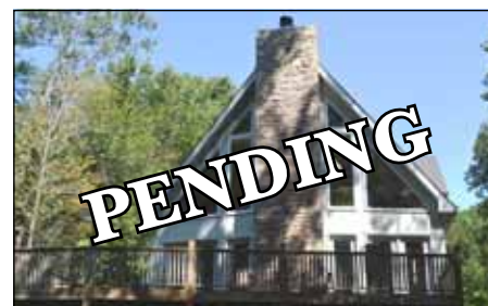
MLS 1884814 - 143 Winns Circle, Sewanee. $375,000