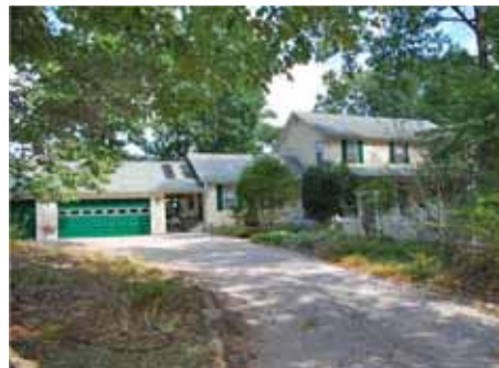
BLUFF - MLS 1397328 - 974 Old Sewanee Rd., Sewanee. $299,000