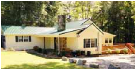
MLS 1490967 - 776 Georgia Ave., Sewanee. $224,000