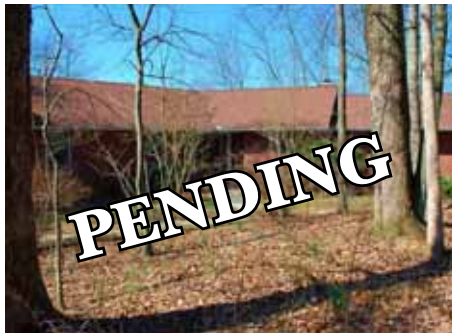
BLUFF - MLS 14335874 - 250 Sherwood Trail, Sewanee. $399,900