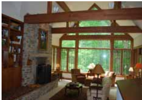
MLS 1358150 - 100 Tomlinson Lane, Sewanee. $598,000