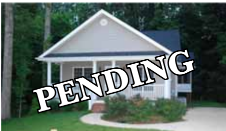
MLS 1371914 -136 Parson's Green, Sewanee. $199,500