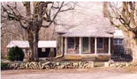
MLS 1503887 - 15 Oklahoma Ave, Sewanee - $225,000