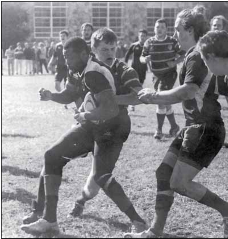
Purple Haze, the Sewanee rugby team, won the Conference championship on Feb. 15 against Lee College.