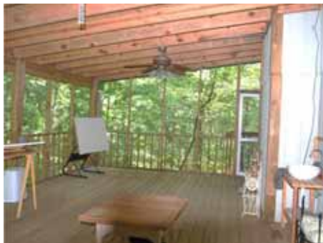
MLS 1302421 - 621 Dogwood Dr., Clifftops. $165,000