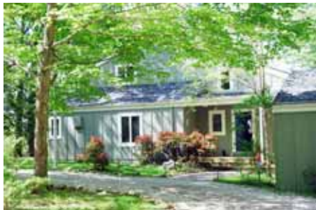
BLUFF - MLS 1492405 - 3442 Sherwood Rd. + cottage, Sewanee. $789,000