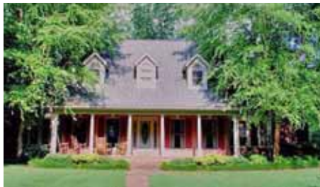
MLS 1467709 - 52 Sherwood Trail, Sewanee. $349,000

—LONG-TERM RENTAL— Jackson Pt. Rd - $1,200