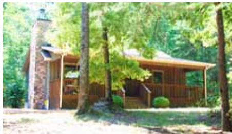
MLS 1479185 - 1150 Sassafras Ct., Clifftops. $224,900