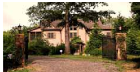
BLUFF - MLS 1458099 - 540 Monteagle Falls Rd. $389,000