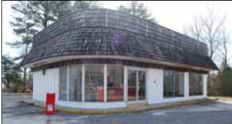
MLS 1514972 - 202 Main St., Monteagle. $112,000