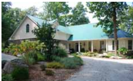
BLUFF - MLS 1484663 13 Sherwood Trail, Sewanee. $975,000