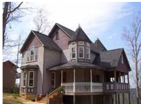
BLUFF - MLS 1503907 - 1801 Bear Court, Monteagle - $299,000