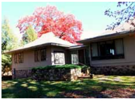
BLUFF - MLS 1490457 - 3217 Sherwood Rd., Sewanee. $770,000