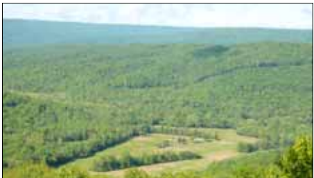
MYERS POINT bluff and lake tracts