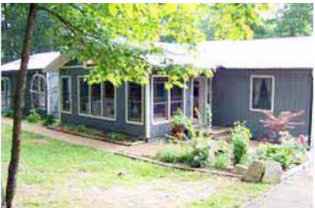
MLS 1499101 - 107 Blackberry Lane, Sewanee. $289,000