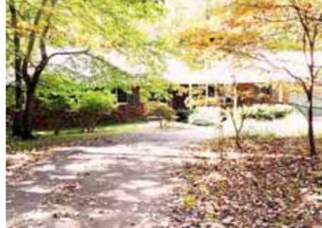
MLS 1492310 - 280 Carpenter Circle, Sewanee. $348,000

—LONG-TERM RENTAL— Jackson Pt. Rd - $1,200