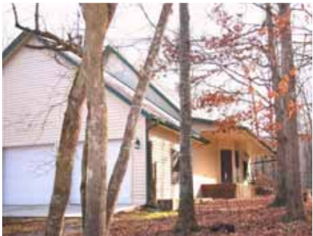
MLS 1516929 - 706 Old Sewanee Rd. +30 ac, Sewanee. $379,000