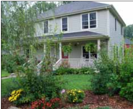
MLS 1476919 - 47 Parson's Green, Sewanee. $179,000