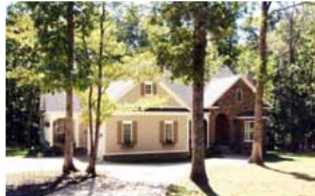
MLS 1490245 - 191 Girault Jones, Sewanee. $349,000