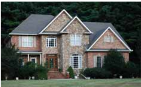
MLS 1487540 - 109 Wiggins Creek, Sewanee. $473,000