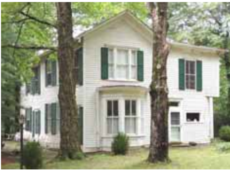
MLS 1513077 - 111 Louisiana Ave., Sewanee. $348,000