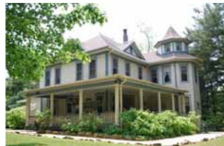
BLUFF - MLS 1360522- 53 Valley View, Monteagle. $449,000