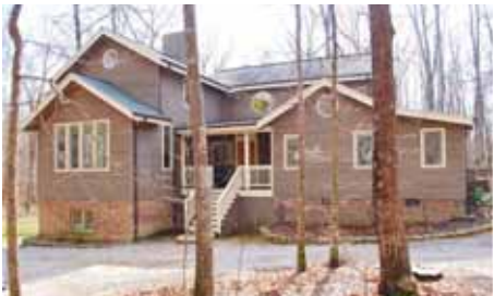
MLS 1431112 - 727 Deepwoods Rd., Sewanee. $398,000