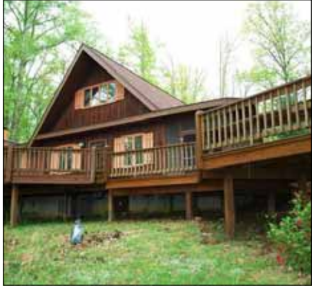
BLUFF - MLS 1777974 - 3480 Sherwood Rd., Sewanee. $349,000