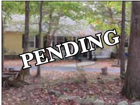
MLS 1774336 - 1848 Ridge Cliff Dr., Monteagle. $283,000