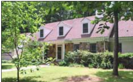
MLS 1688434 - 324 Rattlesnake Springs Rd., Sewanee. 4.9 acres. $349,500