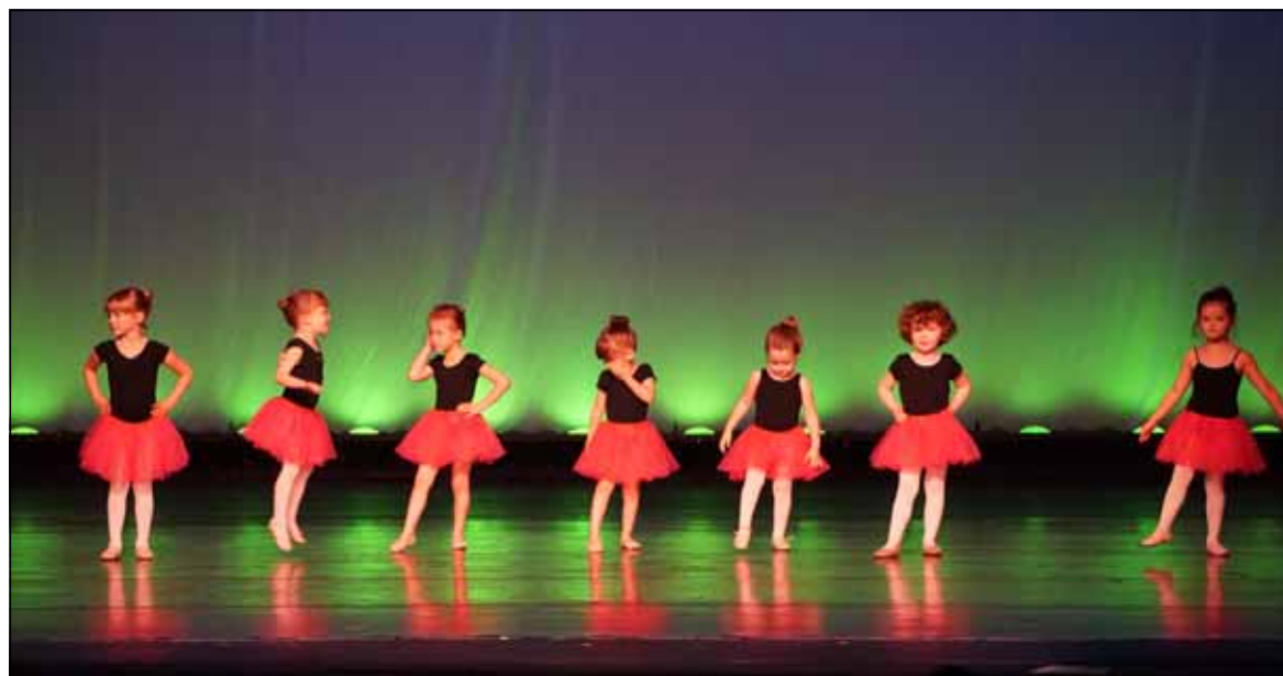
The Sewanee Dance Conservatory will be offering a free community recital at 11 a.m., Saturday, April 8, in Guerry Auditorium to demonstrate to family, friends and community members the dancing skills of our children.