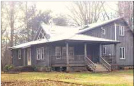
MLS 1698101 - 41 Sherwood Rd., Sewanee. $229,000