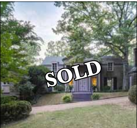
BLUFF - MLS 1775532 - 305 Clara's Point Rd., Sewanee. $949,000