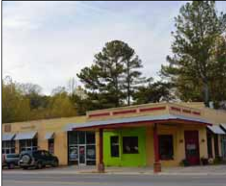
MLS 1776800 - 1256 Sollace Freeman Hwy., Sewanee. $584,000