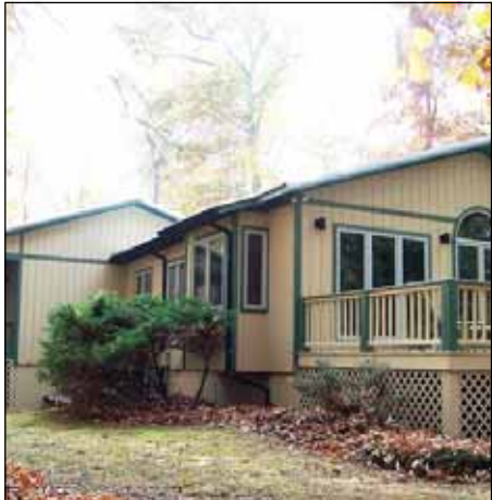
MLS 1810617 - 107 Blackberry Ln., Sewanee. 10.5 acres. $259,000