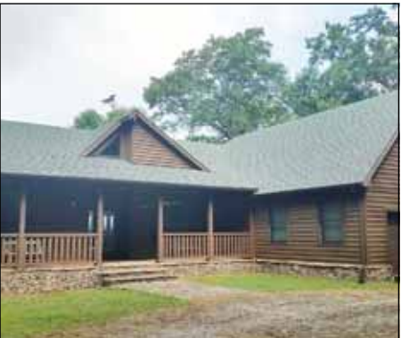
BLUFF - MLS 1656823 - 1613 Laurel Lake Dr., Monteagle. 5.3 acres. $449,900