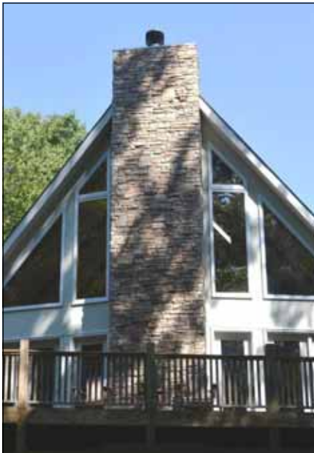
MLS 1775366 - 143 Winns Circle, Sewanee. $385,000