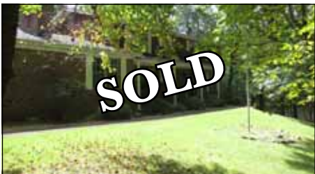
MLS 1667542 - 36 Lake Bratton Ln., Sewanee. $429,000