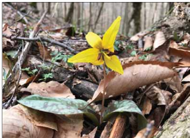
Trout lily.