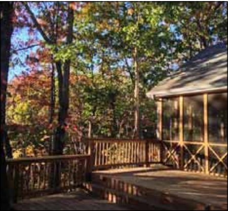
BLUFF - MLS 1810644 - 294 Jackson Point Rd., Sewanee. 20.9 acres. $299,500