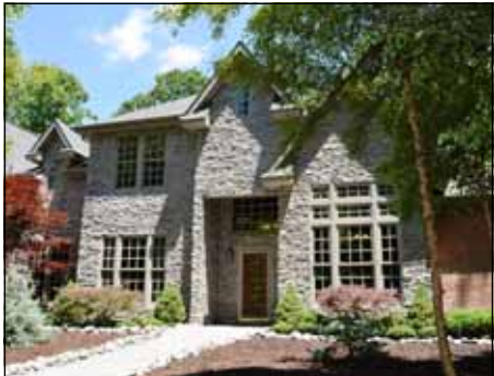
MLS 1743681 - 1091 Timberwood Tr., Monteagle. 26.4 acres. $689,000