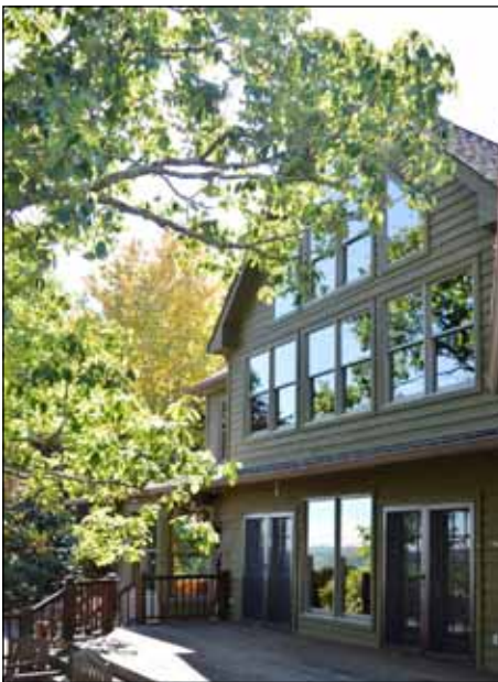
BLUFF - MLS 1773059 - 1804 Clifftops Ave., Monteagle. 6.9 acres. $995,000