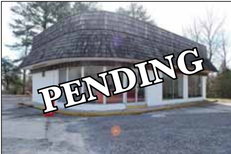
MLS 1514972 - 202 Main St., Monteagle. $112,000