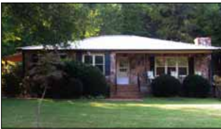
MLS 1770160 - 12147 Sewanee Hwy., Sewanee. $169,000