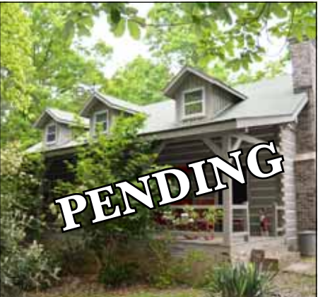
MLS 1730527 - 565 Haynes Rd., Sewanee. 5.4 acres. $249,900