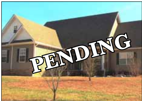
MLS 1786750 - 370 Bud Pattie Rd., Monteagle. $185,000