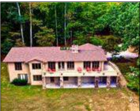
BLUFF - MLS 1772358 - 569 Haynes Rd., Sewanee. 5.1 acres. $589,000