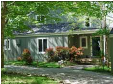
BLUFF - MLS 1712150 - 3442 Sherwood Rd., Sewanee. $589,000