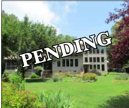
BLUFF - MLS 1648470 - Coyote Cove Ln., Sewanee. 29.5 acres. $469,900