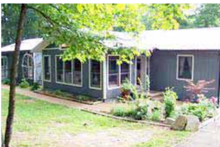
MLS 1499101 - 107 Blackberry Lane, Sewanee. $289,000

—RENTAL— Tennessee Ave. - Available 6/1/14 $1500/month - aglacet@sewanee.edu