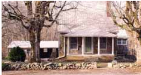
MLS 1503887 - 15 Oklahoma Ave., Sewanee - $225,000