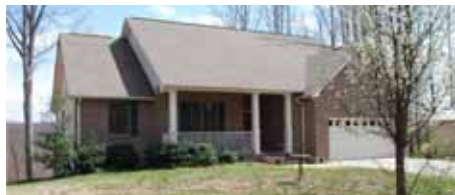
BLUFF - MLS 1440974 - 1804 Ridge Cliff Dr., Monteagle. $199,900