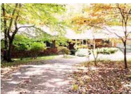
MLS 1492310 - 280 Carpenter Circle, Sewanee. $348,000