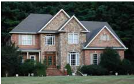
MLS 1487540 - 109 Wiggins Creek, Sewanee. $473,000

—LONG-TERM RENTAL— Jackson Pt. Rd - $1,200