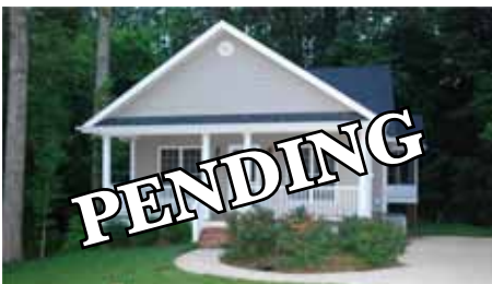
MLS 1371914 - 136 Parson's Green, Sewanee. $199,500