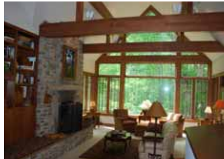
MLS 1358150 - 100 Tomlinson Lane, Sewanee. $598,000