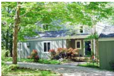
BLUFF- MLS 1492405 - 3442 Sherwood Rd. + cottage, Sewanee. $789,000