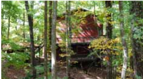
BLUFF- MLS 1437112 - 47 Poplar Lane, Sewanee. $398,000