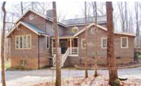
MLS 1431112 - 727 Deepwoods Rd., Sewanee. $398,000