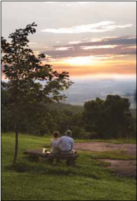
The sunset at St. Mary's Sewanee

Tickets are $60 per person. To make a reservation call 598-5342 or email <reservations@stmaryssewanee.org>. For more information go to <www.stmaryssewanee.org>.