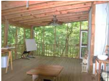
MLS 1302421 - 621 Dogwood Dr., Clifftops. $165,000