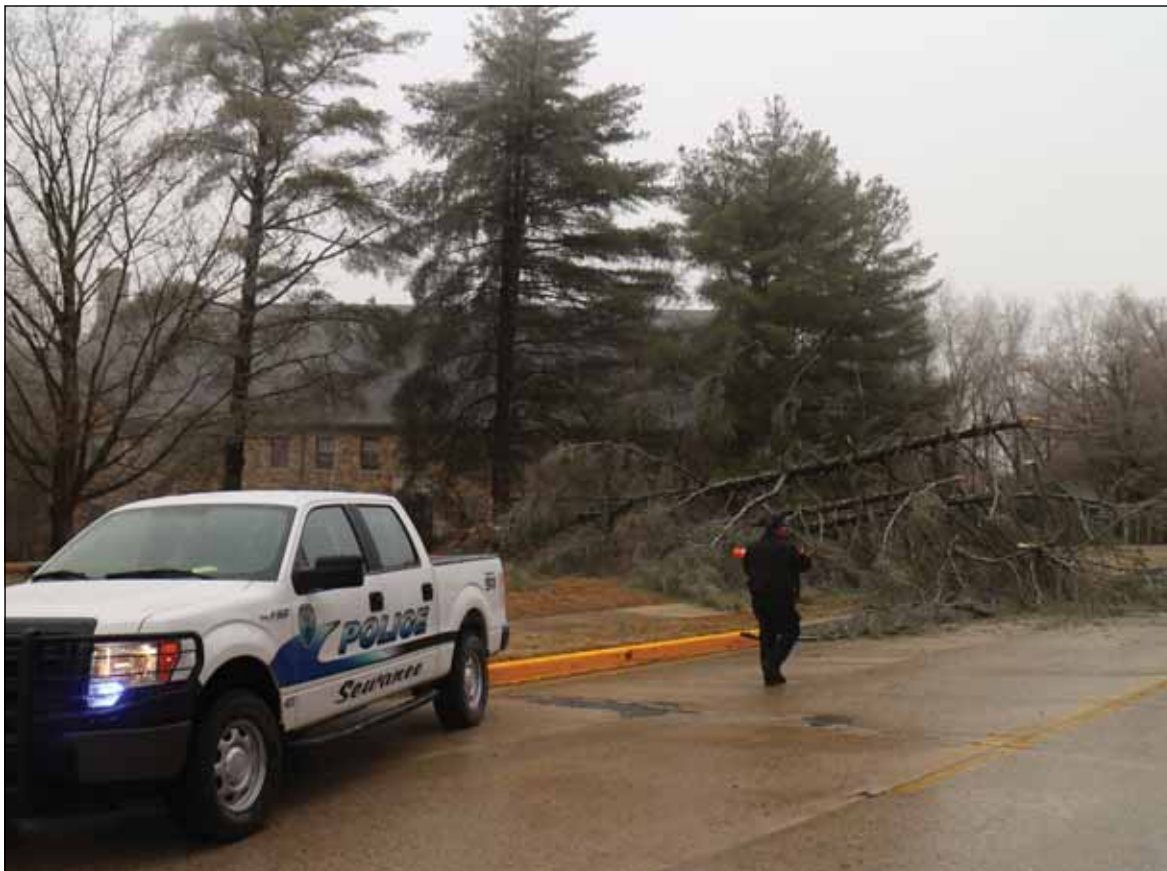
Sewanee's Police Department and the University Physical Plant Services staff worked on March 3 to clear this tree that came down in front of Hunter Hall on University Avenue.