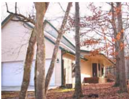
MLS 1516929 - 706 Old Sewanee Rd. +30 ac, Sewanee. $379,000

—RENTAL— Tennessee Ave. - Available 6/1/14 $1500/month - aglacet@sewanee.edu