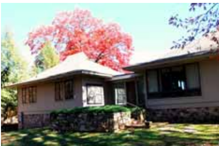
BLUFF - MLS 1490457 - 3217 Sherwood Rd., Sewanee. $770,000