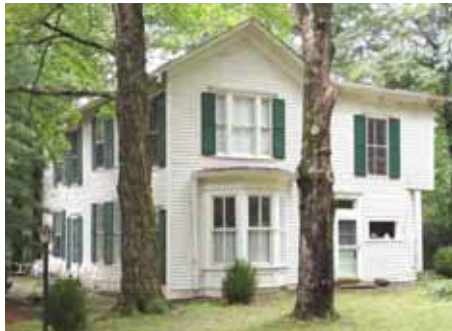
MLS 1513077 - 111 Louisiana Ave., Sewanee. $348,000