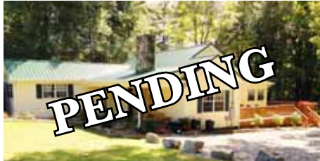
MLS 1490967 - 776 Georgia Ave., Sewanee. $224,000