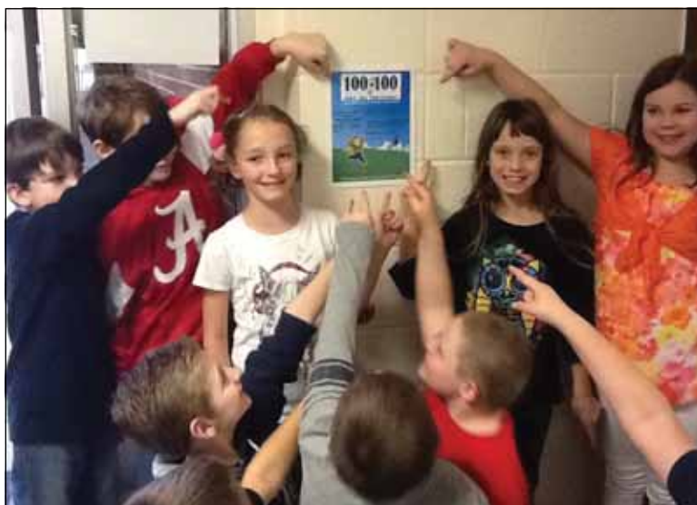
A group of the students at Tracy City Elementary who have taken a pledge to walk 100 miles in 100 days.

That’s me. So I’ll stick with “View from the Dump” to scorn the failing of our culture to do anything about our waste of resources. And be grateful to the two ladies for their use of language as encouragement.