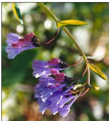
Bluebells on Bluebell Island.

Information and a map are available at < scr.lt.org >. Weather may cancel this event; please check the website for more information.