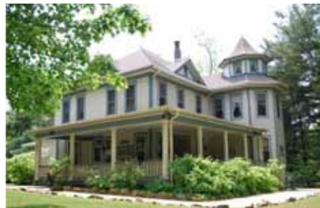
BLUFF - MLS 1360522- 53 Valley View, Monteagle. $449,000