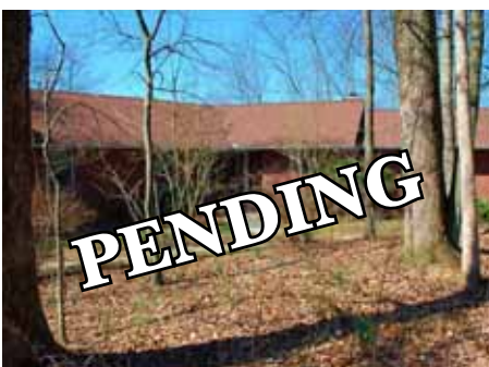
BLUFF - MLS 14335874 - 250 Sherwood Trail, Sewanee. $399,900