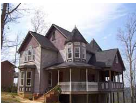
BLUFF - MLS 1503907 - 1801 Bear Court, Monteagle - $279,000