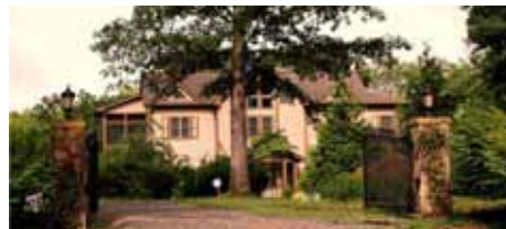
BLUFF - MLS 1458099 - 540 Monteagle Falls Rd. $389,000