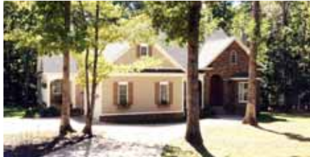
MLS 1490245 - 191 Girault Jones, Sewanee. $349,000