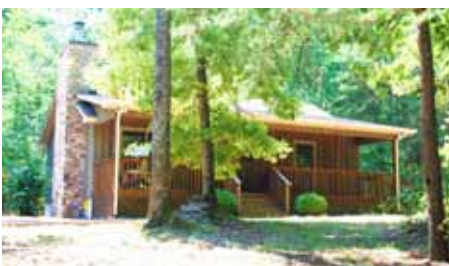
MLS 1479185 - 1150 Sassafras Ct., Clifftops. $224,900