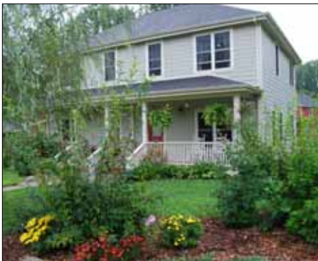
MLS 1476919 - 47 Parson's Green, Sewanee. $179,000