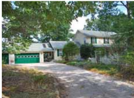
BLUFF - MLS 1397328 - 974 Old Sewanee Rd., Sewanee. $299,000