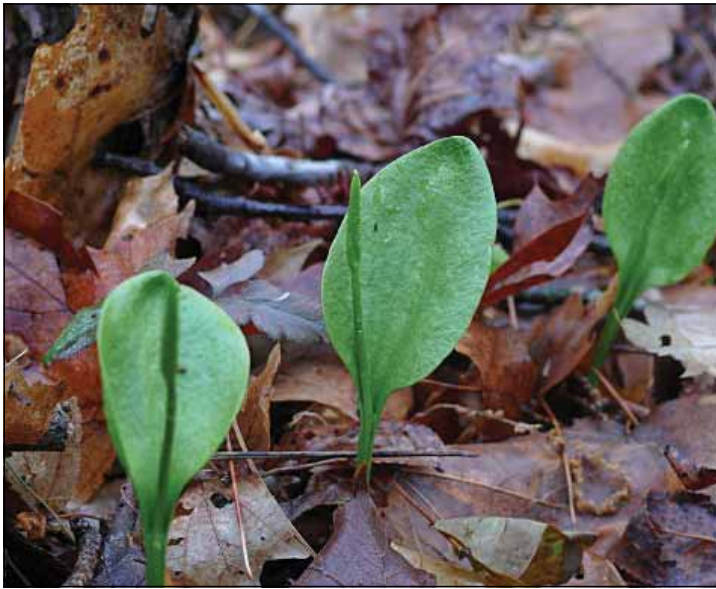
Southern Adder's Tongue