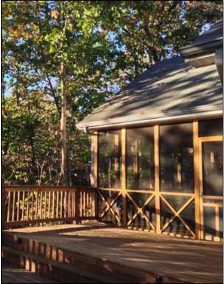
BLUFF - MLS 1810644 - 294 Jackson Point Rd., Sewanee. 20.9 acres. $299,500