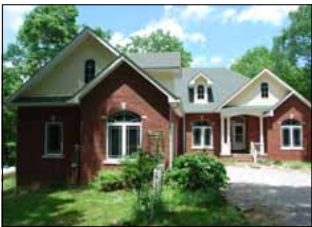
MLS 1740557 - 786 Old Sewanee Rd., Sewanee. 15 acres. $329,000