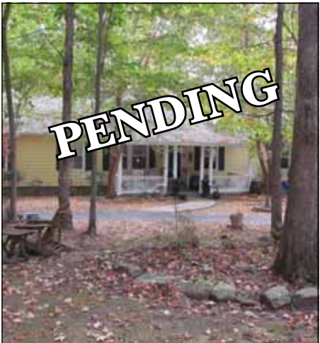
MLS 1774336 - 1848 Ridge Cliff Dr., Monteagle. $283,000