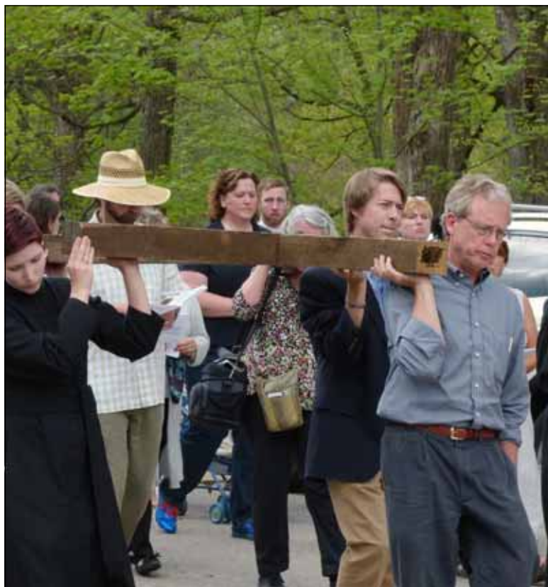
Community members carry the cross on Good Friday.