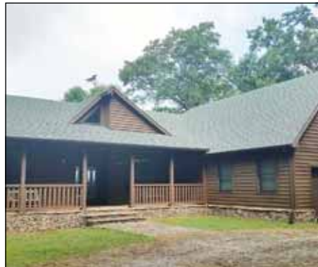
BLUFF - MLS 1656823 - 1613 Laurel Lake Dr., Monteagle. 5.3 acres. $449,900