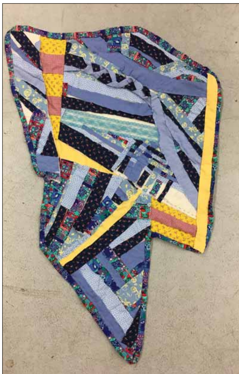
Elizabeth Bleynt's textile piece

Find all the area MLS listings on our updated website!