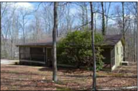
MLS 1815314 - 966 Laurel Lake Dr., Monteagle. 1.3 acres. $159,500