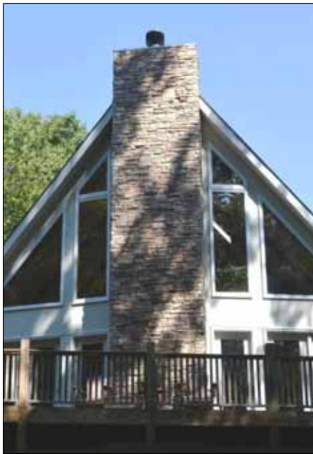
MLS 1775366 - 143 Winns Circle, Sewanee. $385,000