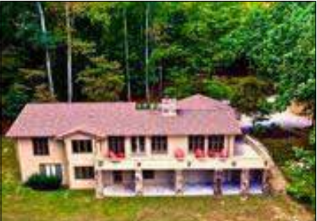
BLUFF - MLS 1772358 - 569 Haynes Rd., Sewanee. 5.1 acres. $589,000