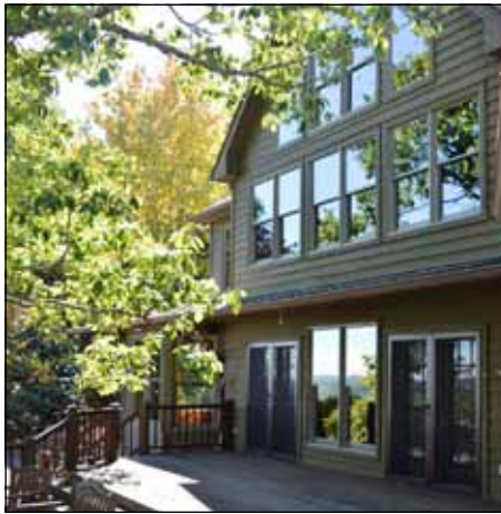
BLUFF - MLS 1773059 - 1804 Clifftops Ave., Monteagle. 6.9 acres. $995,000