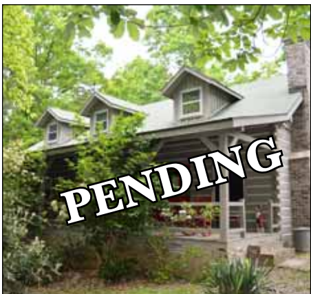
MLS 1730527 - 565 Haynes Rd., Sewanee. 5.4 acres. $249,900