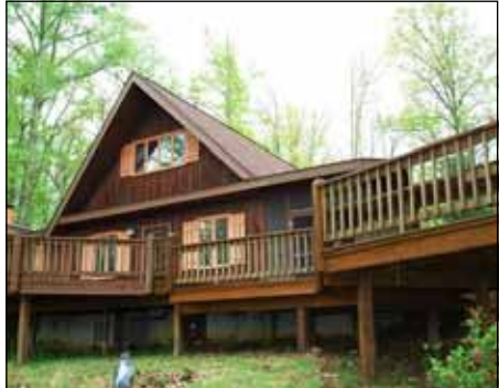
BLUFF - MLS 1777974 - 3480 Sherwood Rd., Sewanee. $349,000