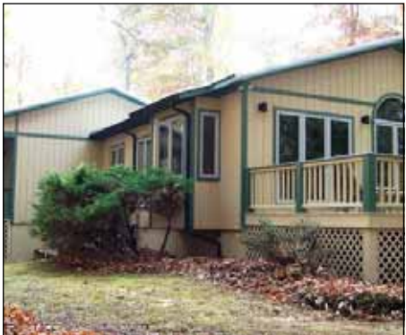
MLS 1810617 - 107 Blackberry Ln., Sewanee. 10.5 acres. $259,000