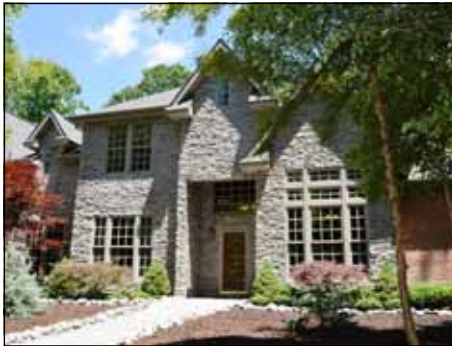
MLS 1743681 - 1091 Timberwood Tr., Monteagle. 26.4 acres. $689,000