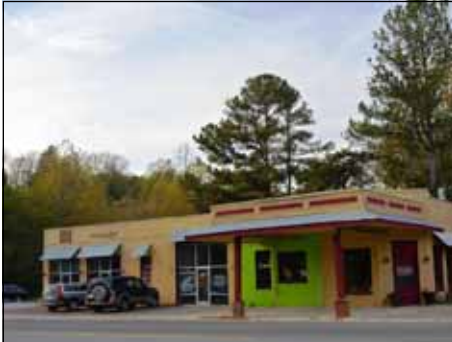
MLS 1776800 - 1256 Sollace Freeman Hwy., Sewanee. $584,000