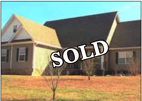
MLS 1786750 - 370 Bud Pattie Rd., Monteagle. $185,000