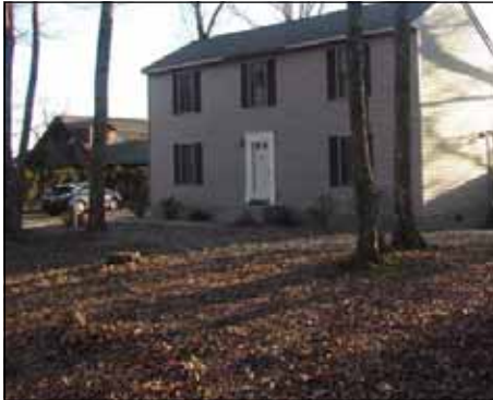
BLUFF - MLS 1817475 - 1819 Bear Court, Monteagle. $229,000