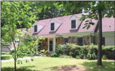
MLS 1688434 - 324 Rattlesnake Springs Rd., Sewanee. 4.9 acres. $349,500