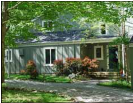
BLUFF - MLS 1712150 - 3442 Sherwood Rd., Sewanee. $589,000