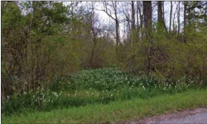
Scilla bloom on both sides of Magnolia avenue in the bog.