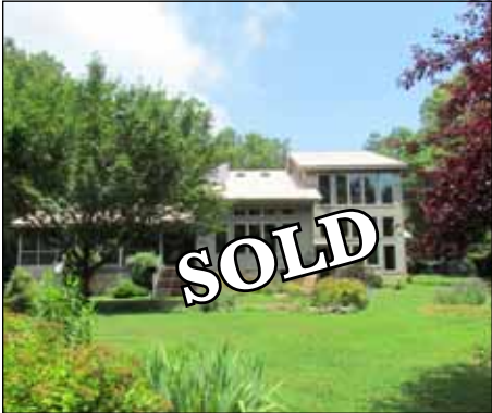
BLUFF - MLS 1648470 - Coyote Cove Ln., Sewanee. 29.5 acres. $469,900