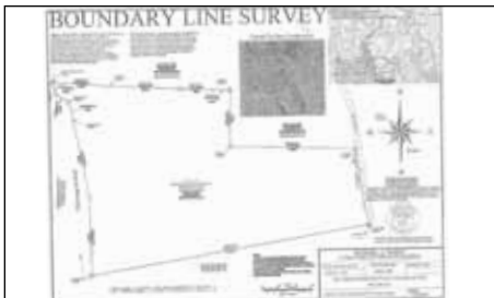
BLUFF - MLS 1748867 - Laurel Lake Dr., Monteagle. 66.7 acres. $395,000