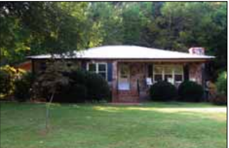
MLS 1770160 - 12147 Sewanee Hwy., Sewanee. $169,000