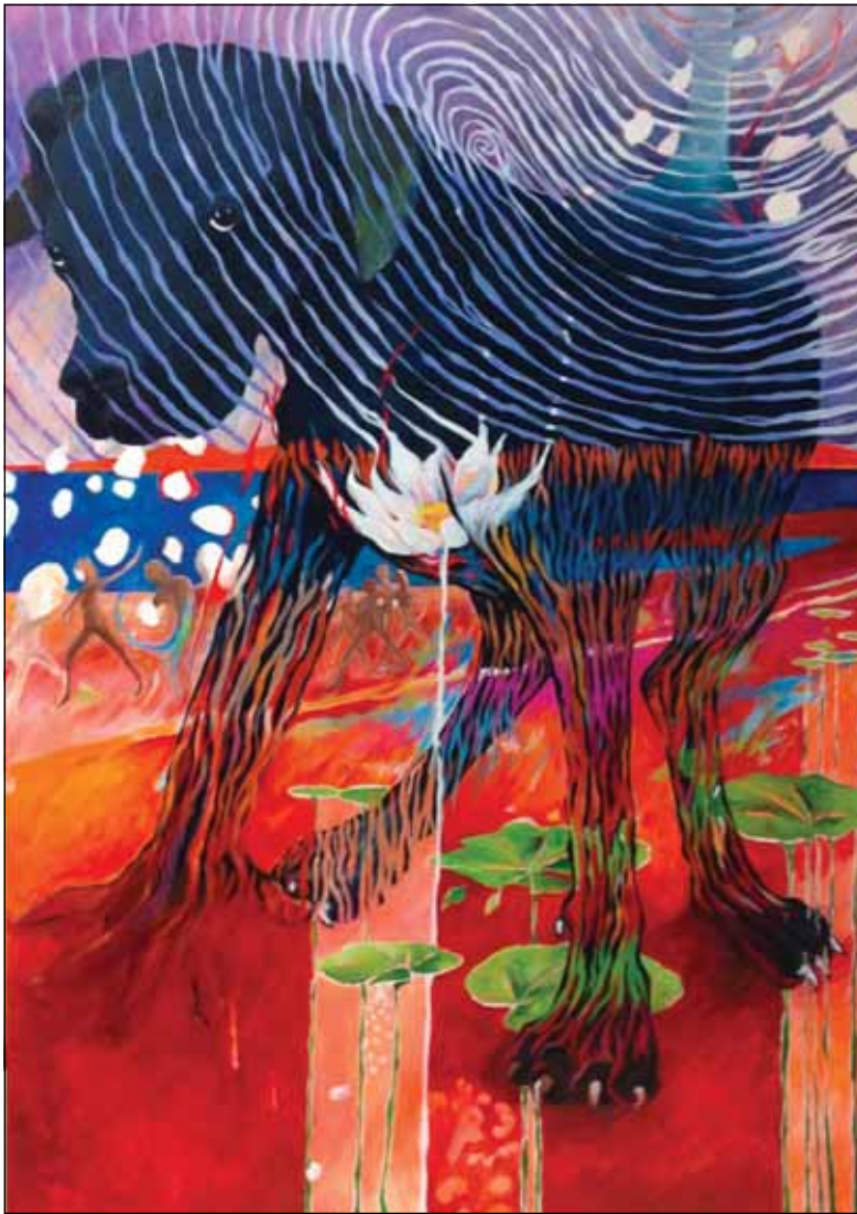
"Lotus Blossom in the body of the beast" by Pippa Browne