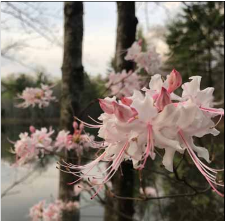
Wild azaleas.