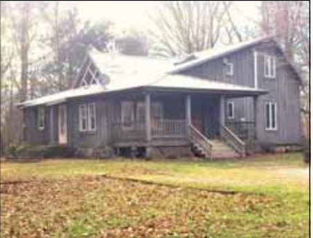
MLS 1698101 - 41 Sherwood Rd., Sewanee. $229,000