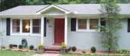
MLS 1124743 - 296 Sherwood Rd., Sewanee. $107,000