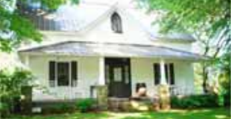
MLS 1191006 - 635 Alabama Ave., Sewanee. $310,000