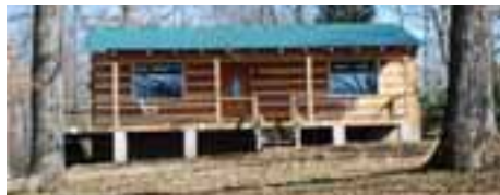
MLS 1170673 - 340 Wrens Nest, Monteagle. $145,000