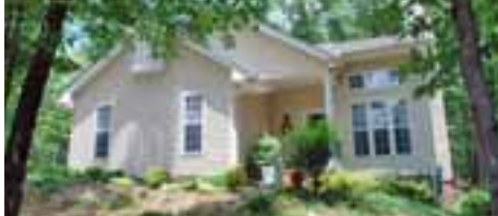
MLS 1094735 - 215 Shadow Rock, Monteagle. $175,000