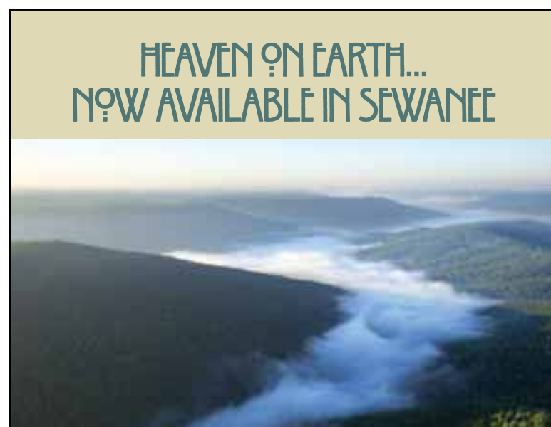
Lost Cove photography courtesy of Stephen Abarez.

The Cumberland Plateau is the world's longest hardwood forested plateau. Widely considered one of the most biologically rich regions on earth. Rivaling the biodiversity of tropical rainforests. It is the home of Myers Point.