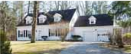
MLS 1160269 - 231 North Carolina Ave, Sewanee. $366,000