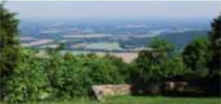
BLUFF - MLS 1101481 - 196 Oleander Lane, Sewanee. $889,000