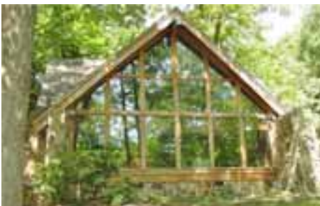
MLS 1168430 - 62 Abbott Martin Lane, Sewanee. $318,000