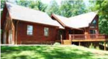
BLUFF - MLS 1198478 - 3335 Jackson Point Rd. $324,900