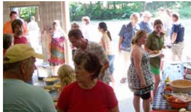
The Jump-Off Community Fire Hall hosted an open house on July 4. Visitors enjoyed hot dogs and all the fixin's, watermelon and sweet tea. The community wanted to show appreciation for volunteer firefighters and first-response equipment in the Jump-Off neighborhood.