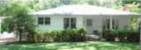
MLS 1189973 - 216 Kentucky Ave., Sewanee. $219,000