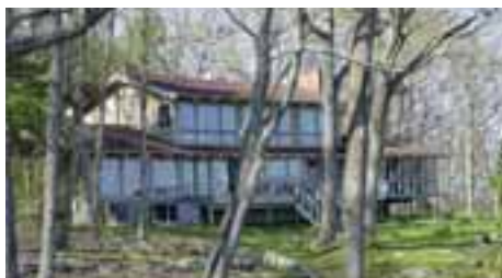
BLUFF - MLS 1162042 - 226 Rattlesnake Spring Lane, Sewanee. $699,000