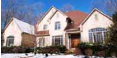
MLS 1151539 - Clifftops - 921 Poplar Place. $675,000