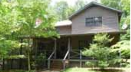
MLS 1071445 - 611 Huckleberry Place, Clifftops. $339,000