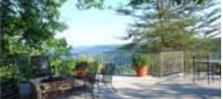
MLS 1186739 - CLIFFTOPS BLUFF - 1323 Overlook Dr. $795,000