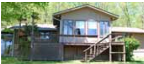
BLUFF - MLS 1177179 - 668 Rattlesnake Spring Road, Sewanee. $466,000