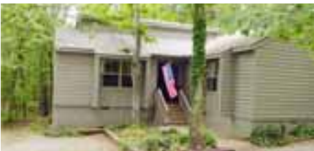
MLS 998887 - 925 Dogwood Dr., Clifftops. $198,000