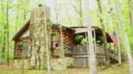
MLS 1193221 - 1425 Clifftops Ave., $239,900