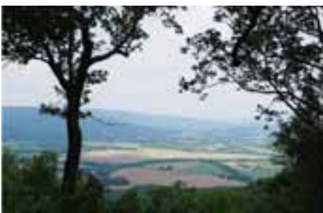
BLUFF - MLS 1183505 - 2807 Deepwoods Rd., Sewanee. $465,000