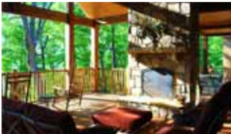
MLS 1137205 - BLUFF 121 Sherwood Trail, Sewanee. $929,000