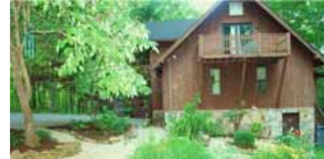
MLS 1275979 - 656 Raven's Den Rd., Sewanee. $329,000