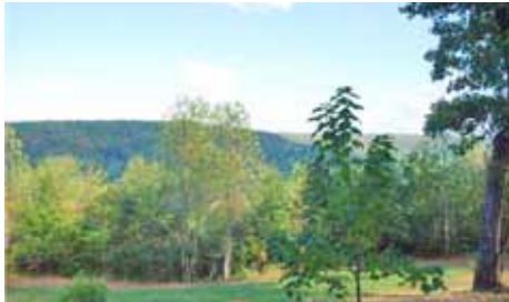
MLS 1305453 - 974 Old Sewanee Rd., Sewanee. $324,000