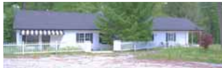
MLS 1274914 - Pearl's, 15344 Sewanee Hwy. $375,000