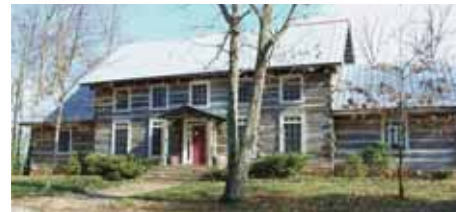
MLS 1252128 - Sewanee area home. $1,200,000