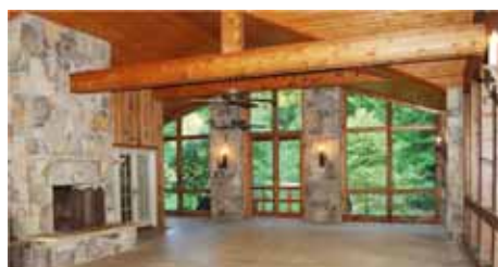
MLS 1242107 - 115 North Carolina Ave., Sewanee. $490,000