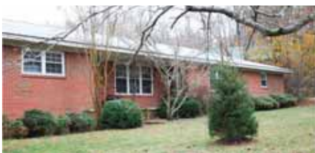
MLS 1264861 - 170 Tate Rd., Sewanee. $325,000