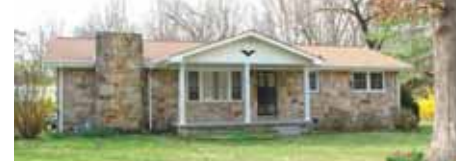
MLS 1264144 - 17 Bluff Circle, Monteagle. $119,000