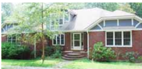
MLS 1221591 - 1290 Old Sewanee Rd., Sewanee. $249,500