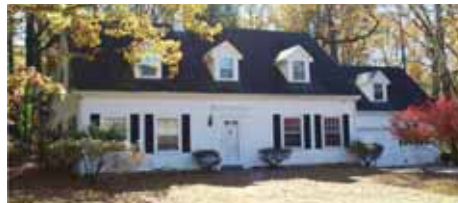
MLS 1160269 - 231 North Carolina Ave., Sewanee. $366,000