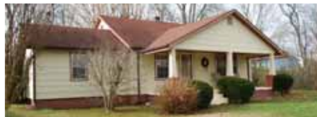
MLS 1142954 - 1200 Little St., Winchester. $98,000