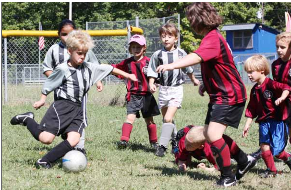
Mountain Soccer/AYSO is in full swing. Read all about it on page 9.