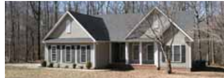
MLS 1252986 - 370 Curlicue, Sewanee. $295,000