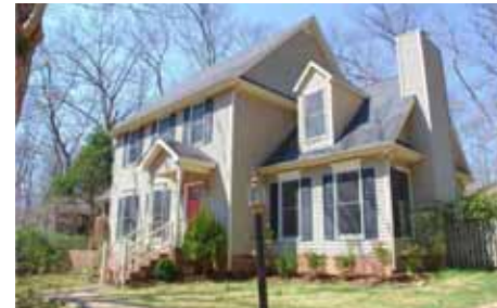
MLS 1260369 - 188 Laurel Dr., Sewanee - $359,000