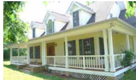
MLS 1280278 - 615 Breakfield Rd., Sewanee. $339,900