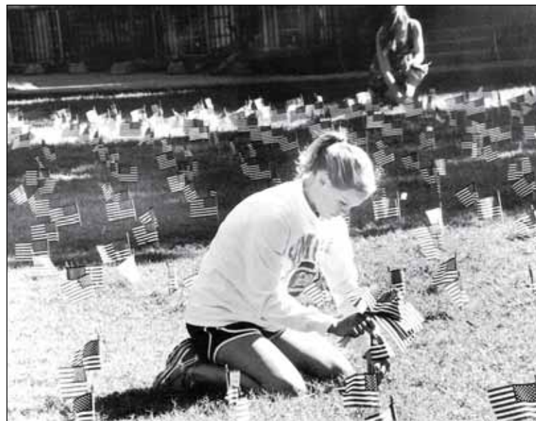
Volunteers from a broad coalition of student organizations placed 2,997 American flags in the Quadrangle as a memorial to those who died on Sept. 11, 2001.