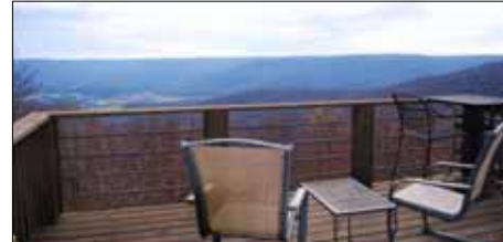
MLS 1214614 - 336 Nancy Wynn Rd., Sewanee. $249,999