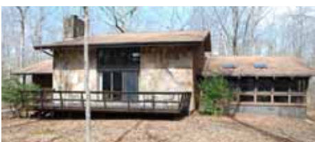
MLS 1262670 - 937 Dogwood Dr., Clifftops. $278,000