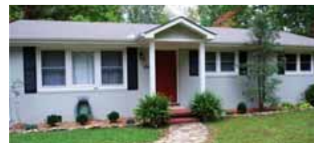
MLS 1286804 - 296 Sherwood Rd., Sewanee. $104,900