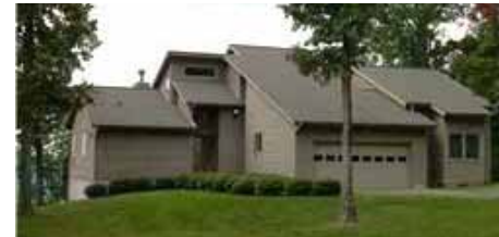
MLS 1257094 - 1811 Bear Court, Monteagle. $289,000