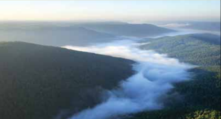
Lost Cove photography courtesy of Stephen Alvarez.

HEAVEN ON EARTH... NOW AVAILABLE IN SEWANEE