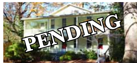
MLS 1176372 - 104 Morgan's Steep, Sewanee. $286,000