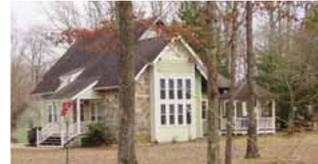
MLS 1233623 - 824 Jim Long St., Monteagle. $249,900