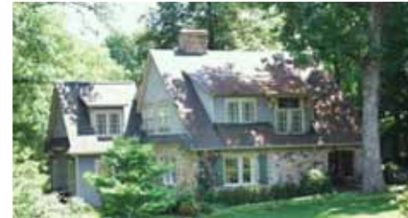
MLS 1279027 - 1116 University Ave., Sewanee. $448,000