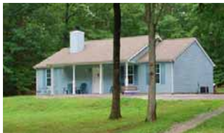
MLS 1298102 - 1521 Jackson Point Rd., Sewanee. $149,900