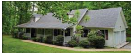
310 Wiggins Creek, Sewanee. $520,000