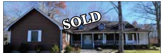
MLS 2312077 - 102 Rabbit Run, Sewanee. $499,000