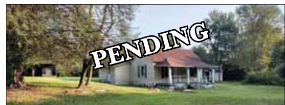
MLS 2290475 - 515 Beersheba St., Tracy City. $54,900