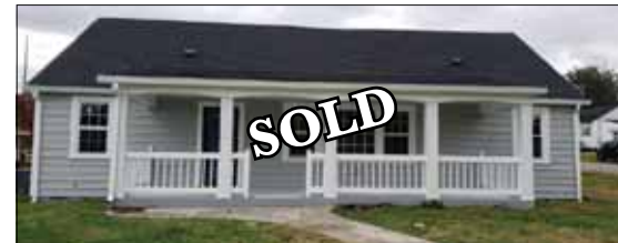
MLS 2312686 - 404 Montgomery St., Cowan. $225,000