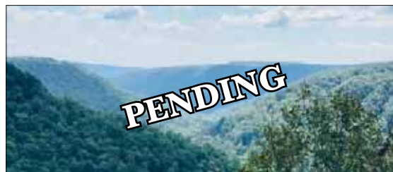
MLS 2365291 - 0 Green Town Rd., Tracy City. 23.54 acres. $279,900