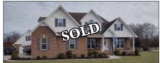
439 Roberts Creek Rd., Manchester. $495,000