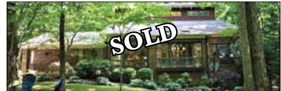
MLS 2269209 - 290 Clara's Point Rd., Sewanee. $699,900 https://youtu.be/Ov3stiQDyZA