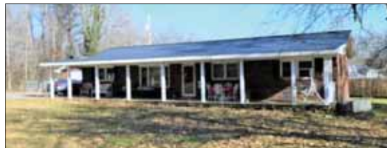
MLS 2313769 - 1919 Main St., Palmer. $218,900