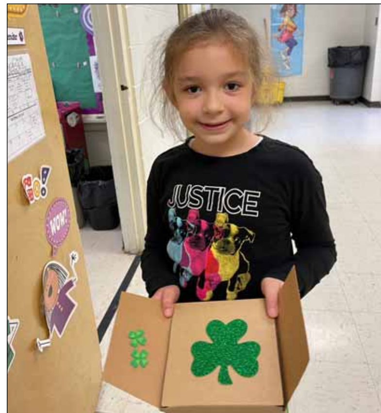
Sewanee Elementary first grade students created leprechaun traps to celebrate St. Patrick's Day. Unfortunately, no leprechauns were caught, but they did cause lots of mischief!

All festival-goers will enjoy an expanded number of vendors and four food trucks. Overhill Nursery will return with an excellent selection of native plants. Other offerings include worm castings from the Boy Scouts, hiking sticks, birdhouses, leather works, candles, soaps, rock jewelry and garden sculpture. Vendors are open Saturday and Sunday.