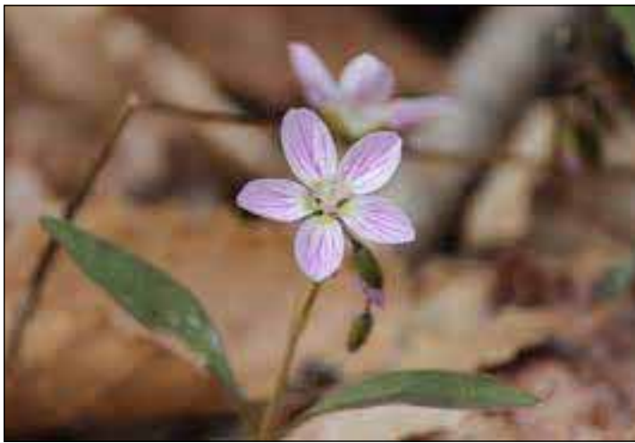
Claytonia caroliniana - Wikipedia