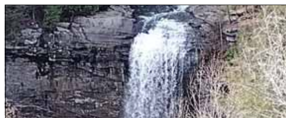
LOTS, 3.5 miles from Foster Falls State Park, in Sequatchie. 150 Hwy. Lot 6, 1.9 acres. $35,000. 150 Hwy. Lot 7, 1.8 acres. $35,000. 0 Hwy. 150 Lot 2, 2.2 acres. $35,000. 0 Hwy. 150 Lot 1, 1.9 acres. $35,000. 0 Mossy PENDING, Lot 11, 5.5 acres. $45,000. 0 Mossy PENDING, Lot 10, 5.7 acres. $45,000. 0 Mossy PENDING, Lot 37, 5 acres. $45,000.