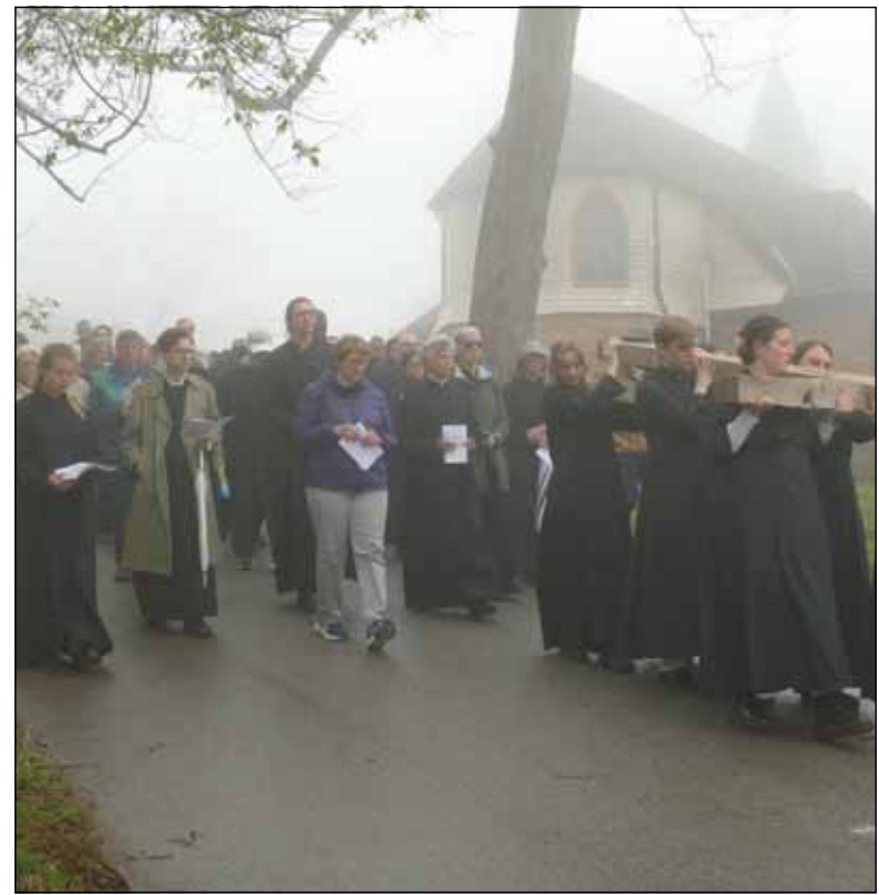
Good Friday on the Mountain was marked by a fog-shrouded observance of the Way of the Cross, processing up University Avenue and ending at All Saints’ Chapel.

On-line registration is now available at < www.afsp.org/seawanee >. You may register individually or as part of a team. We hope you will consider walking with us as we walk to raise awareness and funds for suicide prevention. If you are not able to join us, perhaps you would consider sponsoring a walker or making a donation to this walk. Thank you for your support in bringing suicide Out of the Darkness.