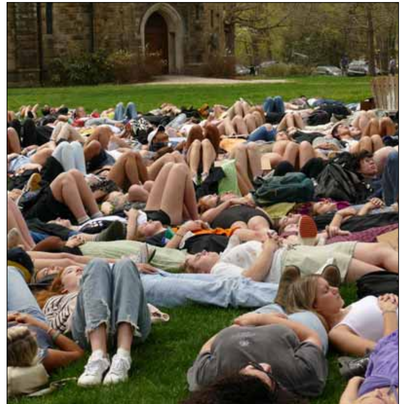
Seawanee students joined tens of thousands of students across the country on April 5 to stage a walkout and “lie in” to protest gun violence. Seawanee faculty, staff, and community members joined the students in a show of solidarity.