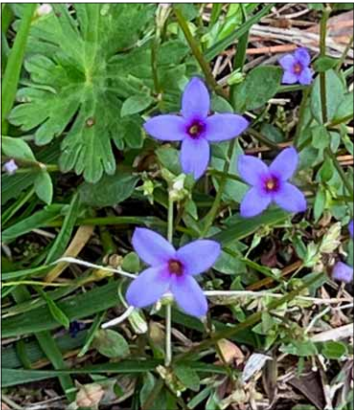
Houstonia pusilla.