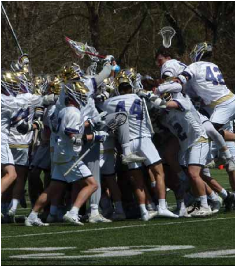
The men's lacrosse team celebrates their double-overtime win over arch-rival Rhodes on April 10.