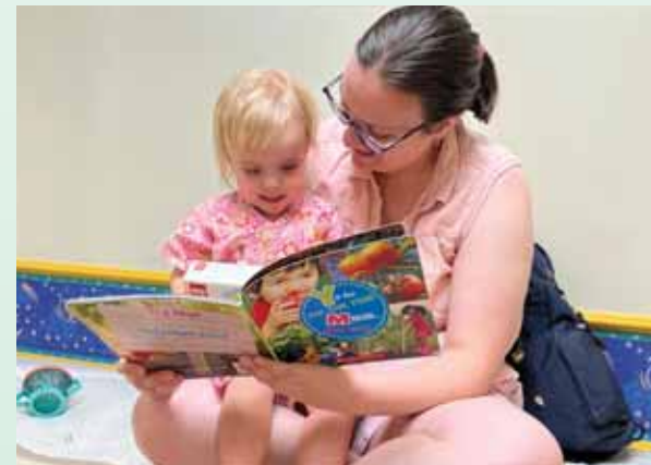
Reach Out and Read