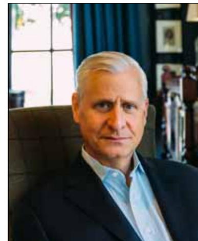
Jon Meacham.

Meacham is the author of numerous New York Times bestsellers, including "American Lion: Andrew Jackson in the White House" — winner of the Pulit-