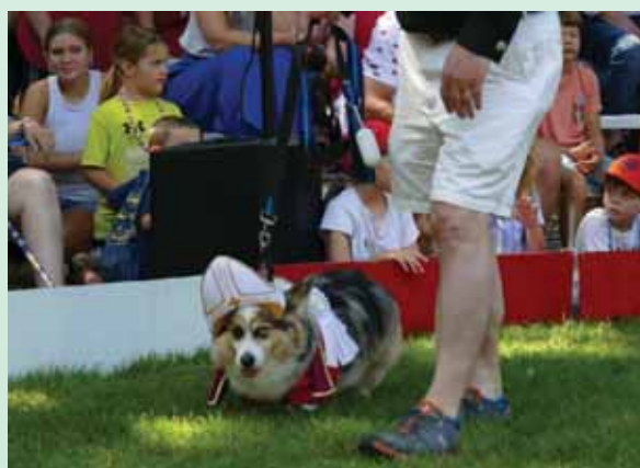
Fourth of July