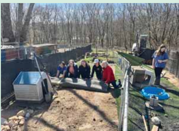
Easy's Dog Shelter