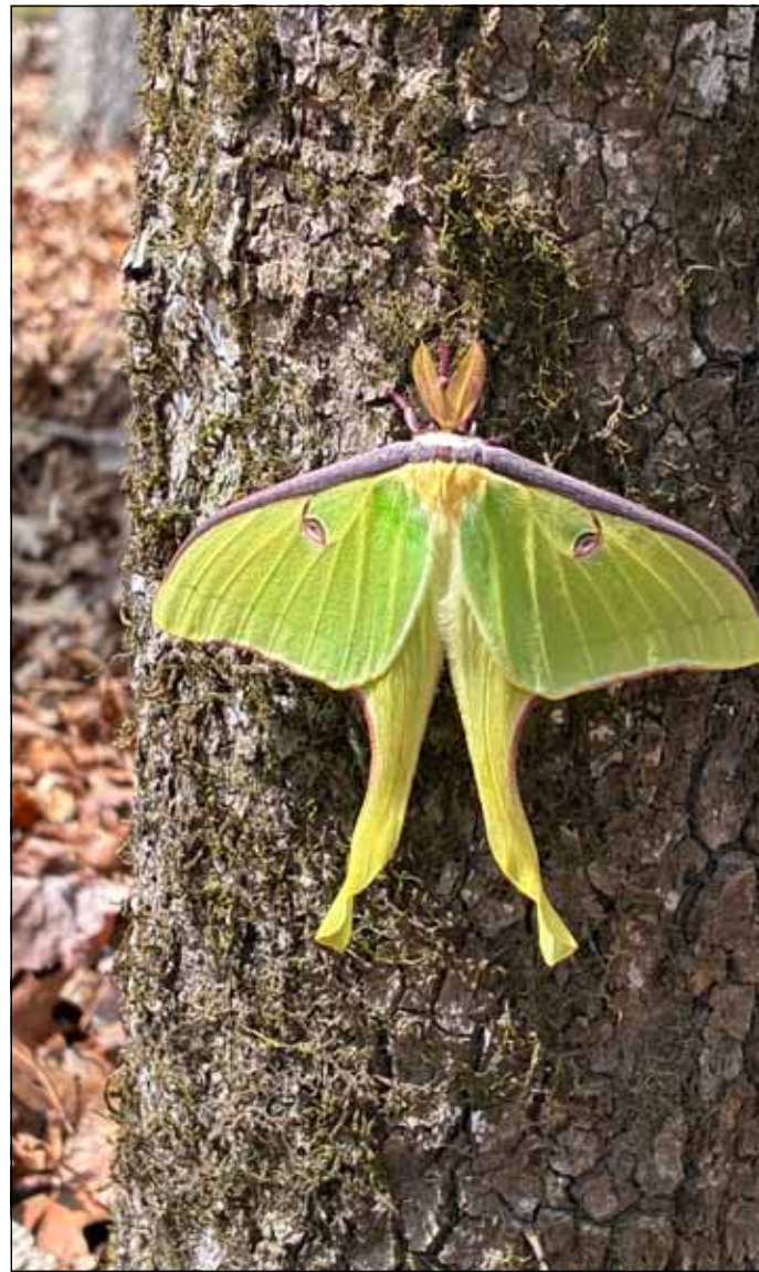
Luna moth.

Lin Cameron spotted the Luna Moth on the trail to Lake Jackson. So beautiful! It is one of the giant silkworm moths. The Luna Moth is one of the largest moths in North America and Mexico, with a wingspan of four and a half inches or more. The adult only lives for 7-10 days in order to mate and lay eggs — it doesn't eat at all and has no mouth parts or digestive system. The fat, lime-green caterpillar, on the other hand, eats voraciously, growing to between two and three inches in two months. Favorite foodplants include various forest trees such as hickory, walnut, pecan, persimmon, and sweet gum. The moth in the photo is apparently a male — its large feathery antennae are used to detect the pheromones of the female, whose antennae are narrower. Check out the online edition of the Messenger to see the moth on all its glory.