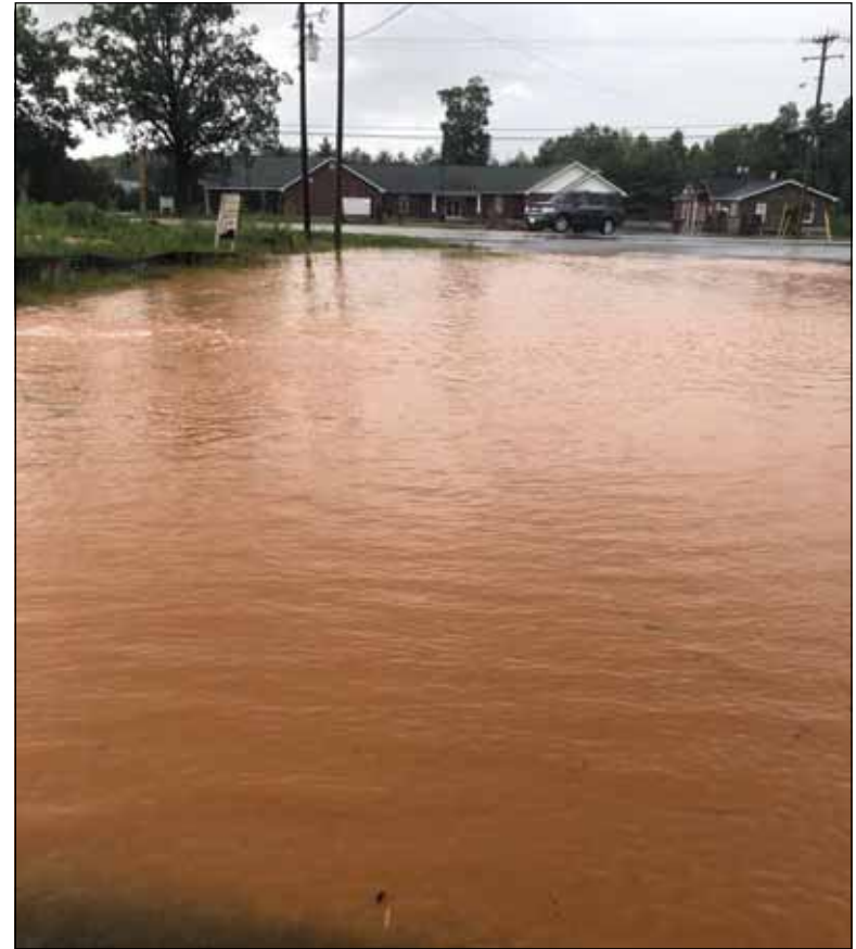
Monteagle stormwater flooding in the area of Dixie Lee Highway and Sampley Street bordering the RBT construction site.