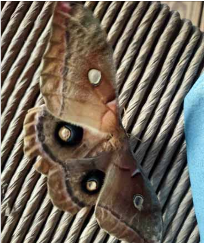
Polyphemus moth.