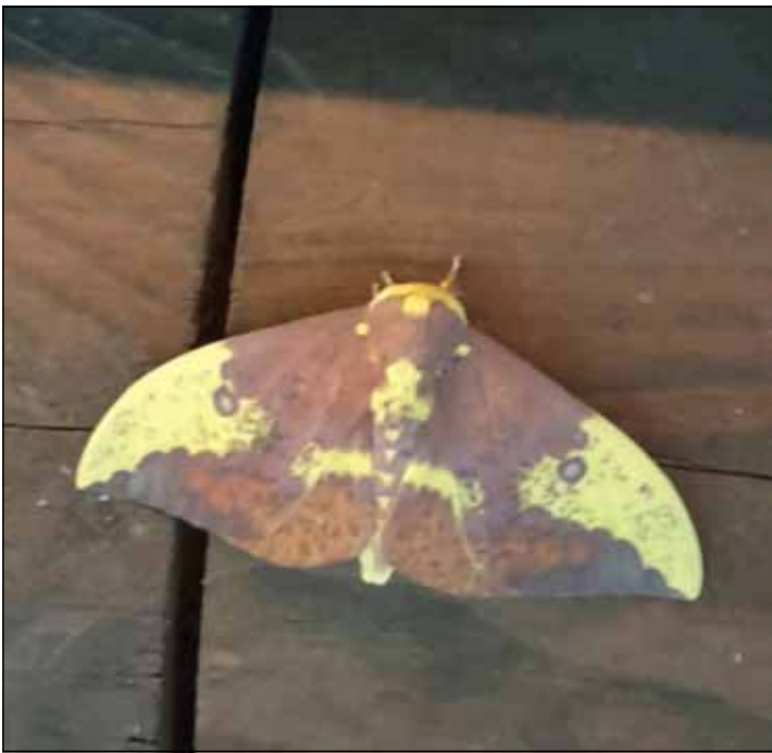
Imperial moth.