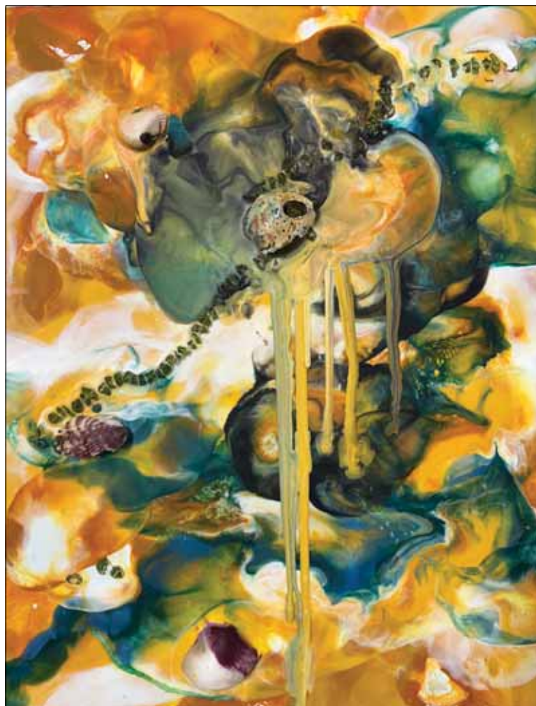
"Fugitive Memory" by Margaret Park

Located in Grundy County, The Caverns is a world-renowned destination known for live music in beautiful natural settings, the Emmy-winning PBS television series The Caverns Sessions, and a magical cave system for different skill levels of exploration. Inside The Caverns subterranean venue, guests to "The Greatest Show Under Earth" revel in the prehistoric venue's natural acoustics and otherworldly beauty. The outdoor amphitheater sits at the foot of the Cumberland Plateau with the rolling Tennessee hills as a backdrop. Whether underground or above ground, live music at The Caverns is a bucket list experience that keeps fans coming back time and again. On-site camping available after most shows. Daily guided walking tours and adventure cave tours of The Caverns cave system offered 7 days a week. Go to < https://www.thecaverns.com > for more information.