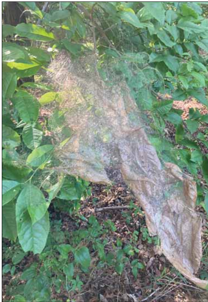
Fall webworms.