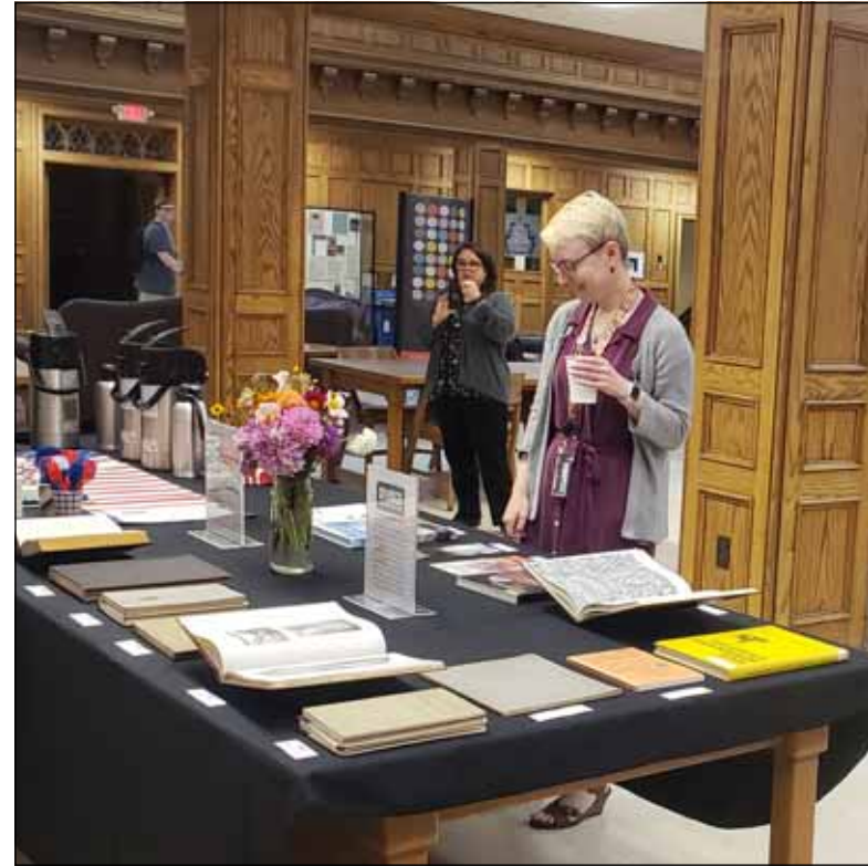
"Documents through the Decades" exhibit at duPont.

For more information go to < www.fallheritagefestival.org > or follow on Facebook at FallHeritageFestivalCowanTn.