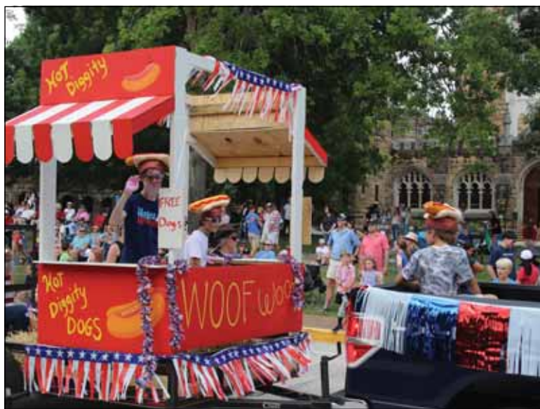
First place float.

Thank you to our prize sponsors, the Piggly Wiggly, Mooney's Market and Emporium, the Sewanee Mountain Messenger, Piggly Wiggly, the Lemon Fair, the Blue Chair and Taylor's Mercantile.