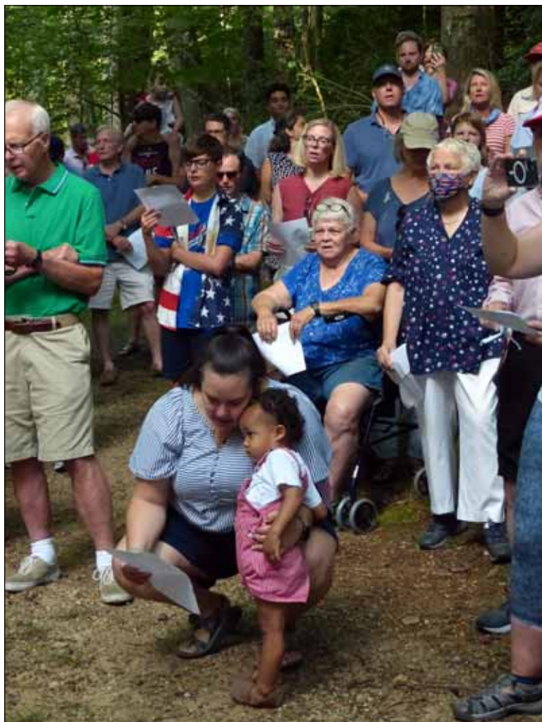
The Hot Diggity All-American Dogs celebration started with a flag raising at Abbo's Alley. More photos on page 6 of this issue.