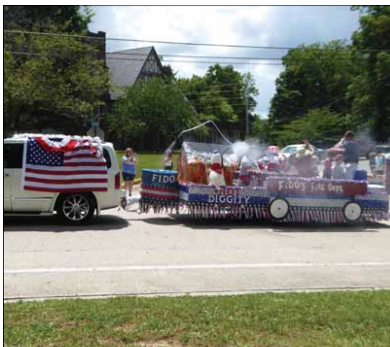
Second place float went to Fido's Fire Department.