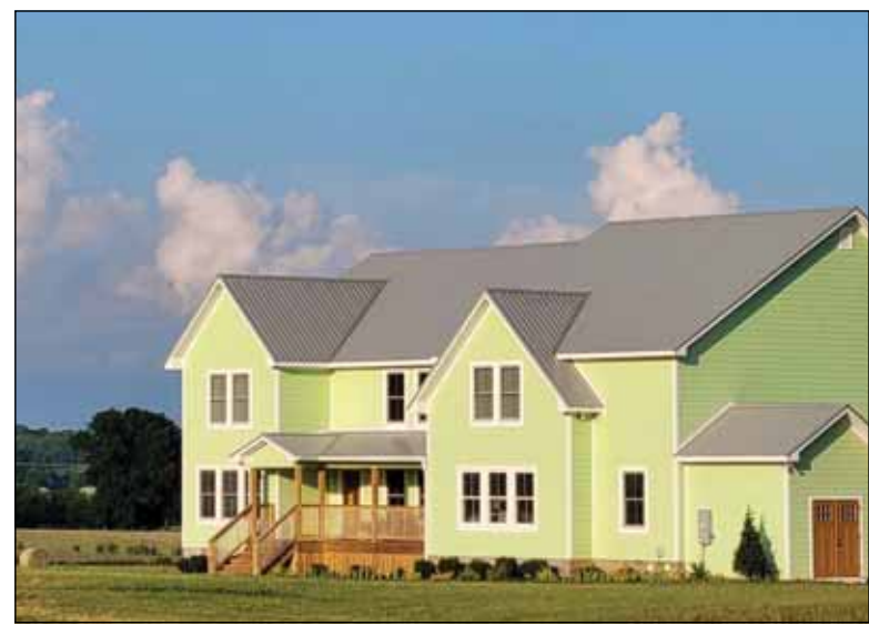
Blue Monarch's New Eight-Family Rechter Home

Saturday, 5:30-8:15 p.m., Mall: Jazz Picnic with Art Four Sale Band. Bring a blanket/chairs; food trucks on site.