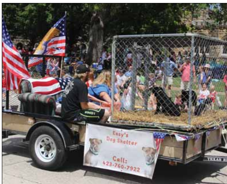
Third place float.

More Sewanee Fourth of July photos in next week's issue!