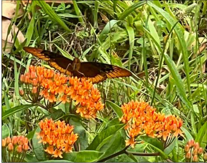
Male Diana Fritillariae.