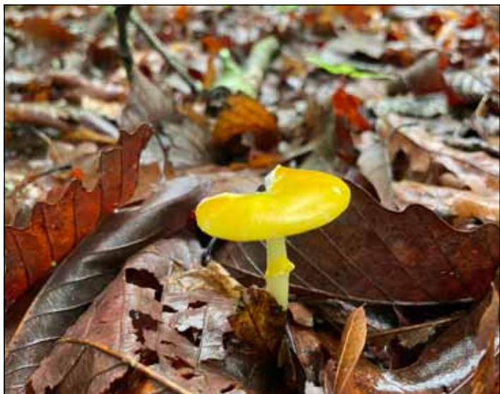
Peck's Yellow Dust Amanita.