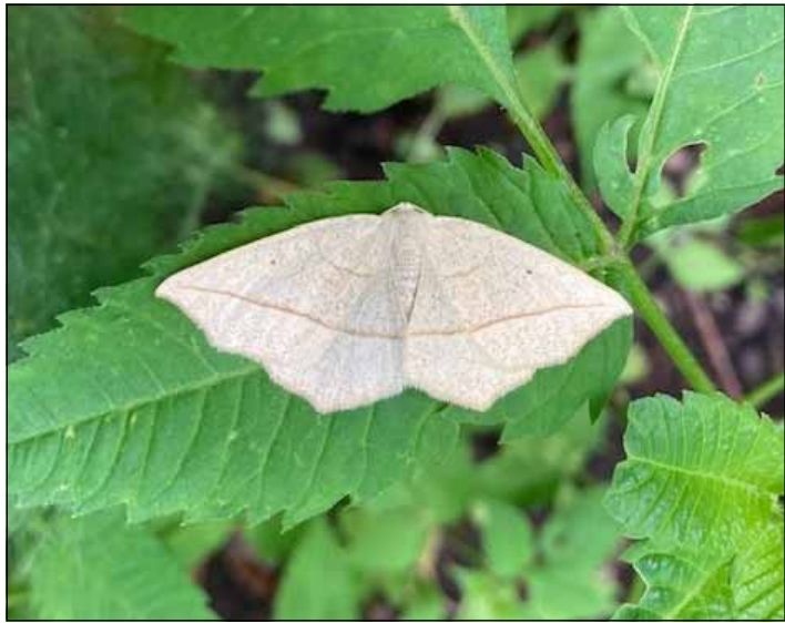
Confused Eusarca moth.