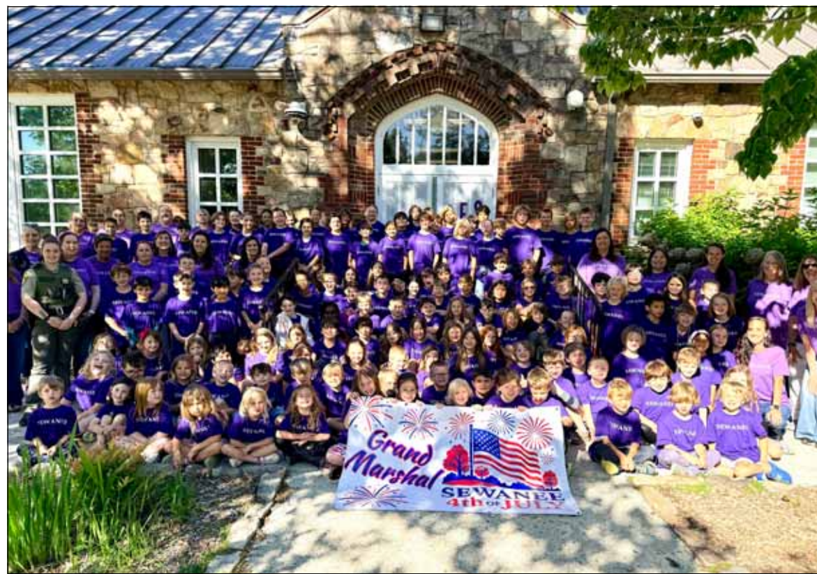
Grand Marshals for the Sewanee Fourth of July G.O.A.T Show!

Friday, July 17, 5:30 p.m. MFA Candidate Reading in Biehl Commons. Go to < https://letters.sewanee.edu/ > for more information.