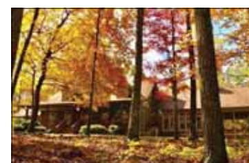
BLUFF - MLS 2611563 - 225 Hollingsworth Cove, Monteagle. $650,000