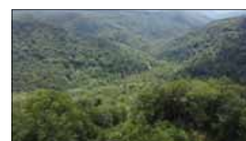
0 Johnny's Way, Tracy City - MLS 2410583 - Lot 1. 6.17 ac. $149,000.