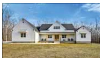
MLS 2617003 - 1058 Deepwoods Rd., Lot 118, Sewanee. $850,000

www.SewaneeRealty.com • Realtors@SewaneeRealty.com