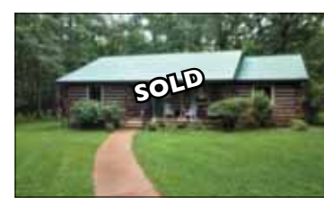
MLS 2539919 - 684 Jump Off Mtn. Rd., Sewanee. 19+ac. $540,000