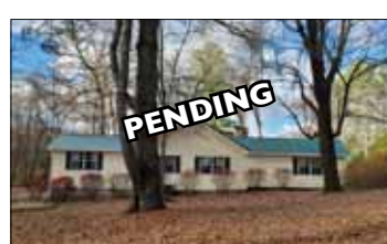
MLS 2595082 - 776 Georgia Ave., Sewanee. $389,500