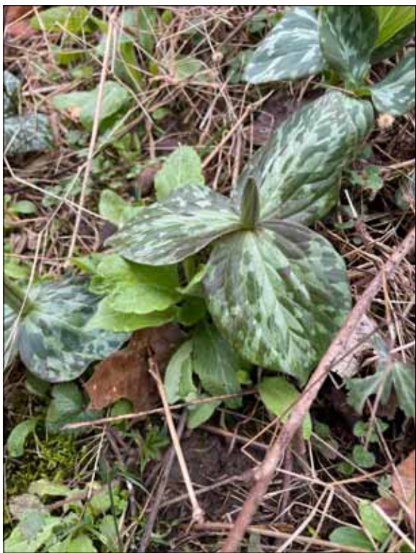
Toadshade Trillium.