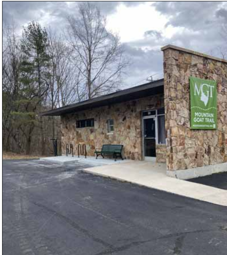
Phase I of enhancing the exterior of the old freight depot is nearing completion.

Daylight Saving Time begins at 2 a.m., Sunday, March 10. Don't forget to set your clocks ahead by one hour before you go to bed on Saturday, March 9.