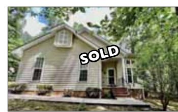
MLS 2551836 - 215 Shadow Rock Rd., Monteagle. $289,500