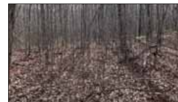
MLS 2615726 - Mossy Oak Lot #35, 5.5 ac. $63,000