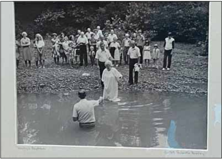
“Dorothy’s Baptism.”

(931) 598-9949 < ads@sewaneemessenger.com > < www.sewaneemessenger.com >